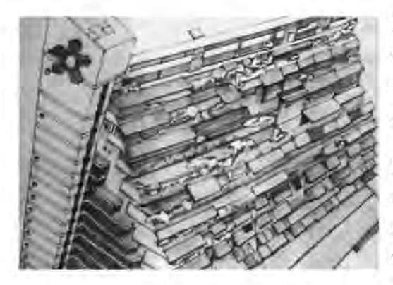
Aerial view of Golden Mile Complex

highly built-up continuum of buildings, arranged in a continuous linear urban development. Decks, podia, railways, bridges, and open spaces connect buildings to each other.