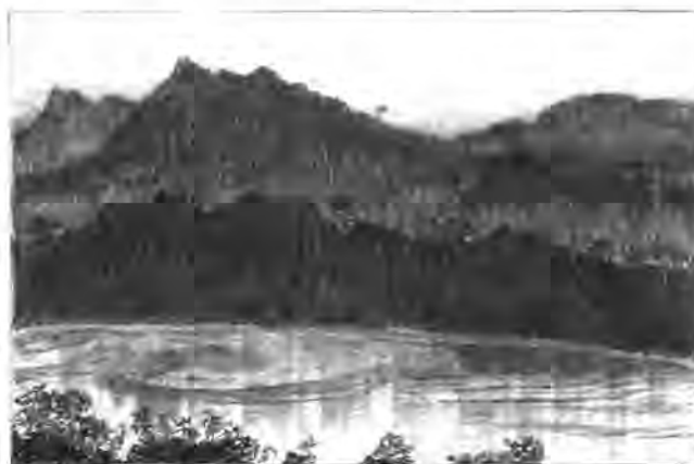
Luang Prabang, Laos

The report said that the trendy mantras in Luang Prabang were concerned with sustainable and ethical eco-tourism as in other parts of Asia, but the operational plans of tourist officials in Laos pushed for “more, more, more.”