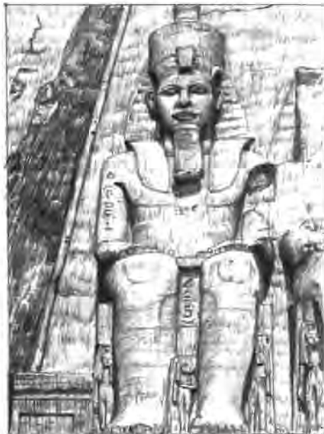
Abu Simbel Temple, Egypt

The historical background to the World Heritage Convention was an event in 1959 which was a major contributing factor: international concern aroused at that time by the decision to construct the Aswan High Dam in Egypt, which would have inundated the valley and destroyed a treasure of ancient Egyptian Civilisation, the Abu Simbel temples.