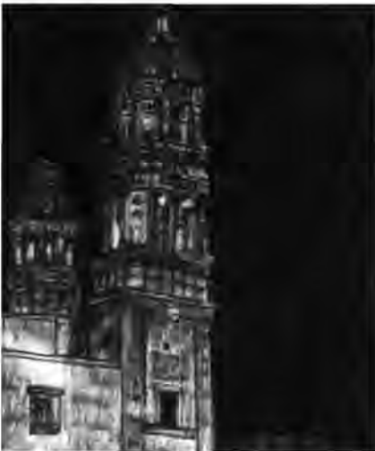
Zacatecas Plaza de Armas, Mexico

He points out that cities, such as Zamose (Poland) and Zacatecas (Mexico) are both in dire need of renovation, but receive scant national or international financial support in their preservation efforts, and that “the accolade ensuing from world heritage designation is more often capitalized on by the tourism industry rather than accompanied by increased preservation efforts.”