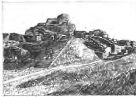
Moenjodaro Archaeological Ruins, Pakistan

Venice and its Lagoon; Indonesia's Borobudur Temple; and Pakistan's Moenjodaro Archaeological Ruins, leading eventually to the implementation of the Convention on the Protection of the World Cultural and Natural Heritage, as well as the establishment of the World Heritage Committee and Centre.