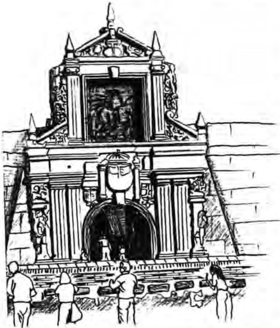
World Heritage site tourism fuelled by commercial interests, illustration by Pattanapong Varanyanon

He writes that there's deepening concern "the scheme, intended to preserve the world's greatest treasures, may actually be contributing to their demise."