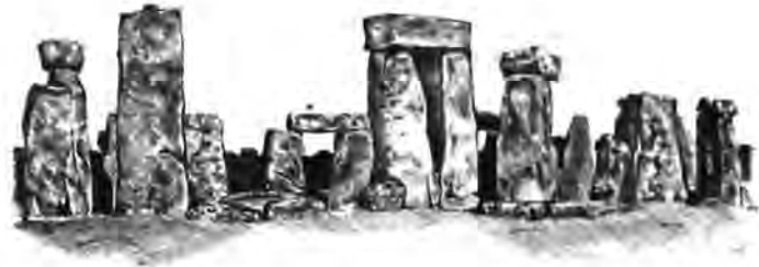
Stonehenge Illustration by Parinee Srisuwan

Despite the obligation following listing that ensures international protection of the site, the authors argue that tangible protection of the site must be carried out at the national level, making international assistance impractical, particularly since Unesco requires that a national World Heritage Act be implemented as a condition for inscription.