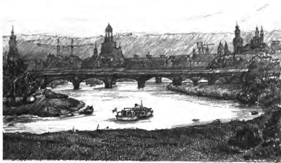
Dresden Elbe Valley

T he World Heritage Committee ("the Committee") has recently decided to remove Germany's Dresden Elbe Valley from Unesco World Heritage List "due to the building of a four-lane bridge in the heart of the cultural landscape which meant that the property failed to keep its outstanding universal value as inscribed".