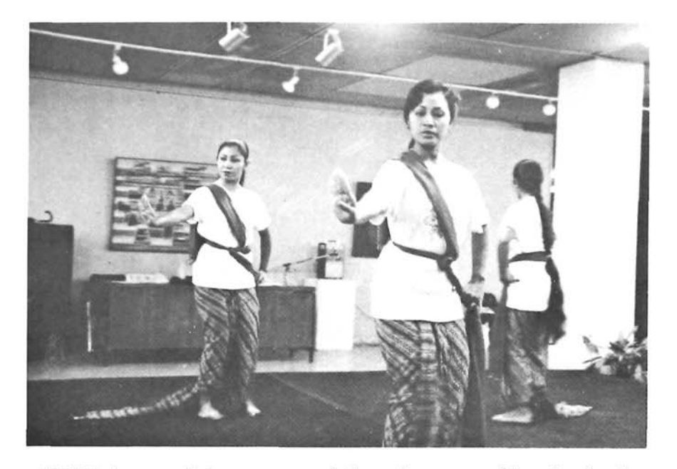
ASEAN dance workshops are one of the main sources of learning for the Singaporean Malay dancers.

For the much publicized Youth Festival, many school children were able to enjoy themselves in the glamorous costumes and glittering theatrical lighting, be it in Malay, Indian or Chinese dance. These dance performances, although routine, are an important educational tool to stimulate the creativity and cultural identity of these young people. The packaging of the national dance trinity constantly reminds the students the reality of multiculturalism in Singapore.