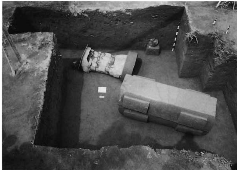
Combined burial systems: sarcophagus and bronze kettledrum excavated in Manikliyu, Bali (1997)

contains human bones in flexed position. Almost similar to the Pejeng type, this Manikliyu kettledrum is decorated with eight stars on the