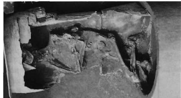
Bronze kettledrum contained human bones in flexed position (detailed), Manikliyu, Bali (1997)