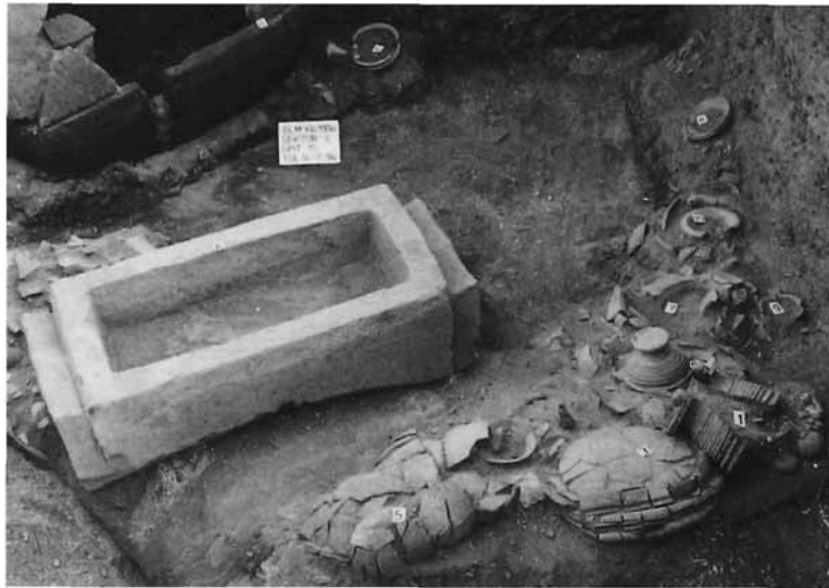
Combined burial system: sarcophagi and urn burial, Gilimanuk, West Bali (1994)

It contained double jars, sarcophagi, and uncovered burial (as in Gilimanuk), and sarcophagi combined with opened burial (as in the village of Keramas, Gianyar). A variety of funeral gifts such as bronze goods (rings, bracelets, spirals, axes and shovel) and carnelians were buried with this burial.