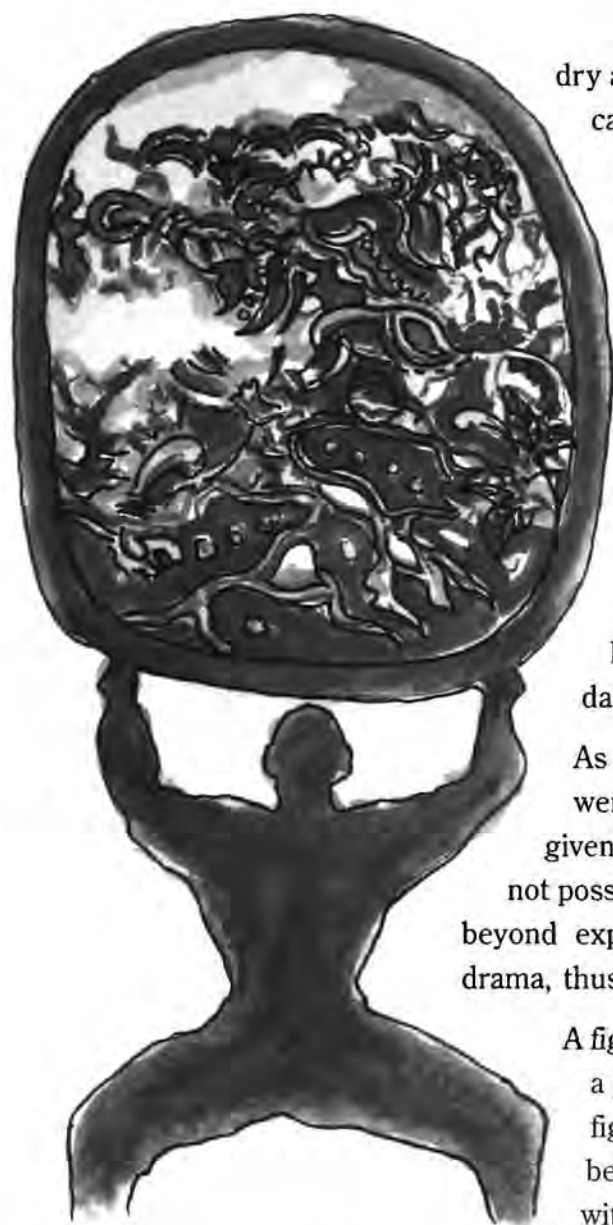
Illustration by Pattanapong Varanyanon

dry and brittle Nang Yai figures (this was where the humidifiers came of use).