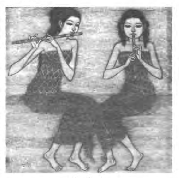
'Flute Players' Painting by Mulyadi W Indonesia

However, it can be argued that it is not an essential requirement of any "gallery-goer", for example, to have specialised knowledge of artistic products, and surely the nature of art is such that anybody who enters a gallery or museum will still be able to judge and appreciate art works at their own discretion, however art-experienced they are. This is the unfortunate implication of a sociological investigation into art's effect on social status - we tend to ignore the leisure element in which arts participation is primarily for. Therefore, much time is wasted on arguing about how appreciation of art has the effect of classifying the 'appreciator' into a social class, i.e. one who enjoys art is of the higher class and highly educated, a mistake of course. Art is basically a leisure past time, and it can be a