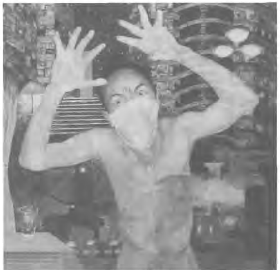
'SARS' Painting by Long Tuan Tran Vietnam

A problem which becomes more obvious as one is drawn deeper into bringing together a group of activities that can be classed as 'art' is a realisation that it is actually an almost impossible task to place