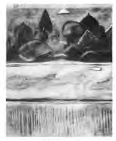
'The Journey' Painting by Sharifah Fatimah Zubir Malaysia

Inevitably, meanings and values of works of art have to depend, at some point, on taste. Bourdieau (1979) wrote that "taste is an acquired disposition to 'differentiate' and 'appreciate', and it functions as a tool of social orientation – an individual's taste guides them to a specific social clique". In fact, sociologically, consumer tastes set the conditions for how cultural goods, such as