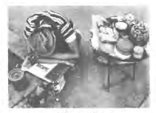
'Cigarette Vendor' Photo by Claro Cortes IV Philippines

Contrastingly, culture has been separated from the idea of a mechanical society – one based purely on work and capitalism – repressing any creative input whatsoever (Waters, 1989). An unfortunate