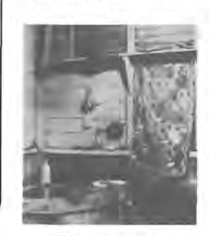
'The Bathroom'

Zoe Matthews shares some of her thoughts on supporting the promotion of arts.