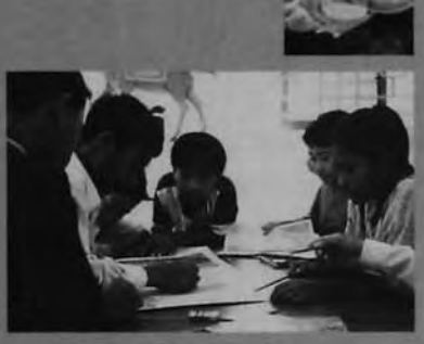
Making good use of their time

The Reyum art school is funded by a generous grant from the Kasumisou Foundation.