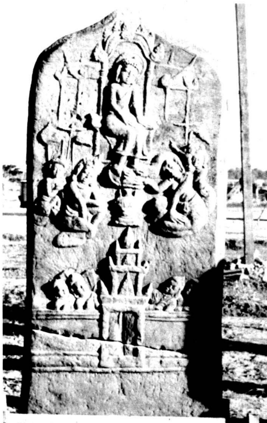
Fig. 6. A stone slab representing the life of Buddha when he returned, after his enlightenment, to his native town, Kapilavastu. Shown on his left is his former wife, Bimba. She was so grieved she spread her hair to wash his feet. The young boy, held by a nurse, and pointing at Buddha is probably Rahula, their son. Seated on the right are Buddha's father and a relative. In this scene a wooden pavilion and a wooden gate are in view. Found at Muang Fa Daed Sung Yang, Kalasin. Khonkaen National Museum. Dvaravati style. Ninth-Tenth century A.D.

From these various points, we remember that the astonishing influence of Dvaravati was not political. It was entirely religious. The spread of its art was a matter of be-