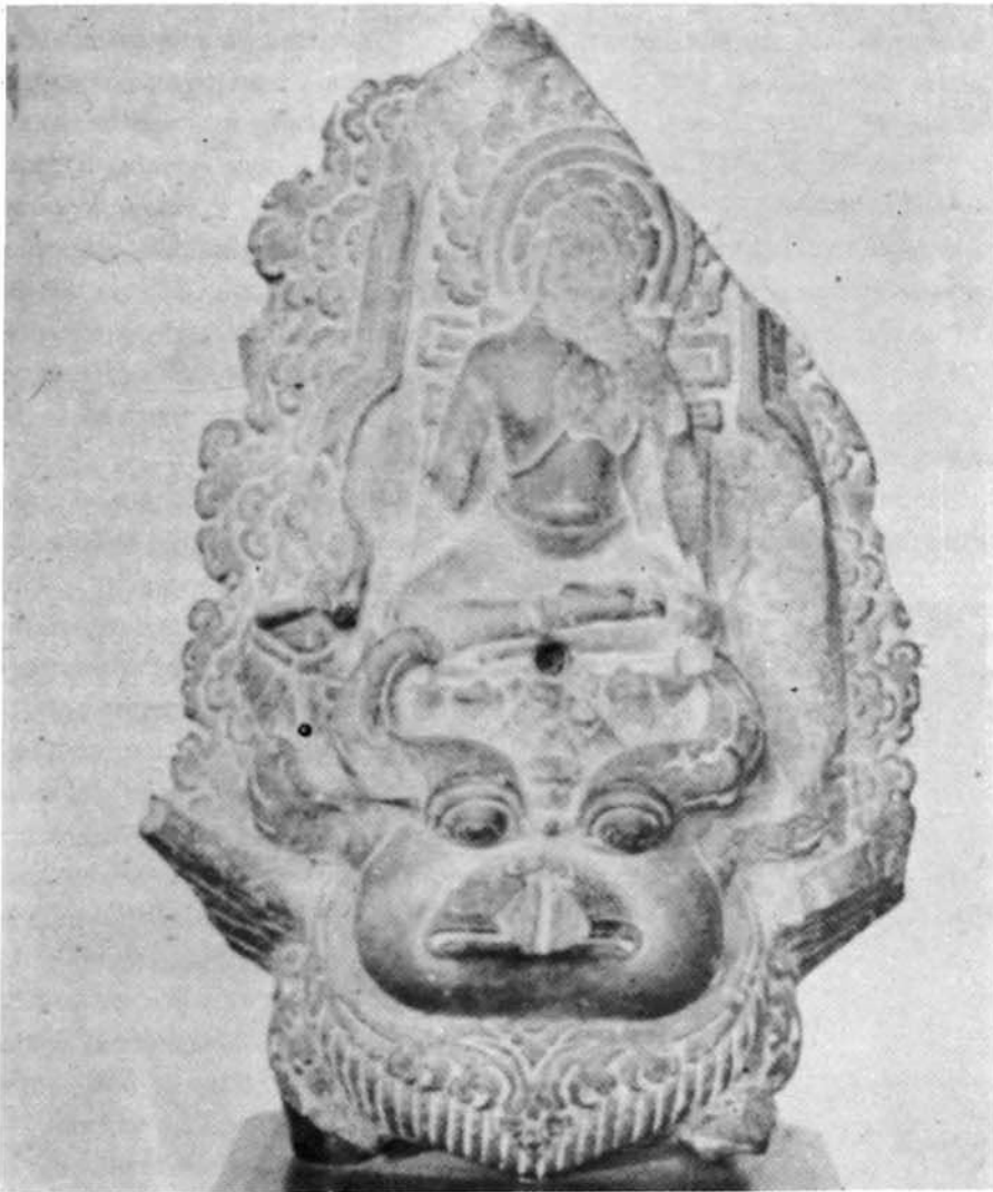
Fig. 7. Buddha seated on Panasbati. Stone. Ht. 67 cm. Eighth to Tenth Century A. D. Transferred to the Bangkok National Museum from Pitsanulok Museum.

However, it left behind very significant evidences. First, in architecture and the architectural deco-