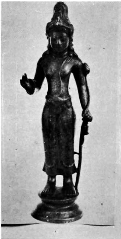
Fig. 8. Standing Avalokitesvara. Bronze. Ht. 24.5 cm. Eighth-Ninth century A. D. Found at U-Thong, Suphanburi Province. Srivijaya style. U-Thong National Museum.

ration, the Srivijaya influence was a real renewal. This is particularly perceptible in U-Thong and Ku Bua, where the spread of simple Avalokitesvara images showed a specific iconography (Fig.8). Second, it gave rise to the importance of Buddhism in the Sanskrit language. This type of Buddhism was however not always related to the Mahayanist influences, which seemed to have