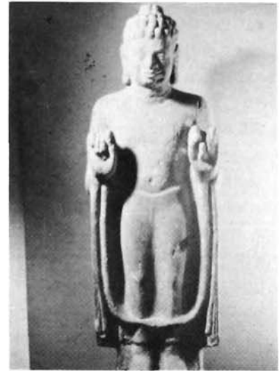
Fig. 4. Standing Buddha image of Dvaravati Period. (Boisselier)