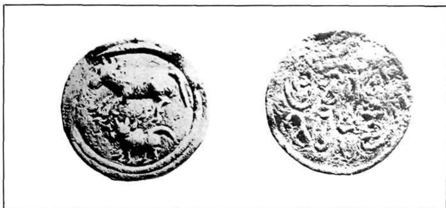
Fig. 1. Dvaravati coin. Silver. Diam. 19 mm. Seventh century A. D. Found at Nakhon Pathom in 1959. On the obverse is a cow and her calf. On the reverse exists an old Sanskrit inscription which reads "Sri Dvaravatisvara Punya" which can be translated as "the good fortune of the King of Sri Dvaravati". Bangkok National Museum.

The existence of a Dvaravati kingdom and its approximate location towards the beginning of the seventh century is now well known. In his translation of the "Report on the Western Regions" by Hsuan-Tsang, Samuel Beal suggested as early as 1884, that the name To-Lo-Po-Ti was the same as Dvaravati. At the time of Hsuan-Tsang, in the Indochinese Peninsula, there existed