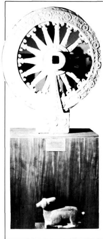
Left : Fig. 5. Wheel of the Law, inscribed with the text of the first sermon of Buddha. Stone. Diam. 89 cm. Seventh-Eighth century A. D. Dvaravati style. Found at Wat Saneha, Nakhon Pathom by H.R.H. Prince Bhanubandhu Yugala.

ogy of Northeast Thailand which has, up to now, revealed its relative originality.