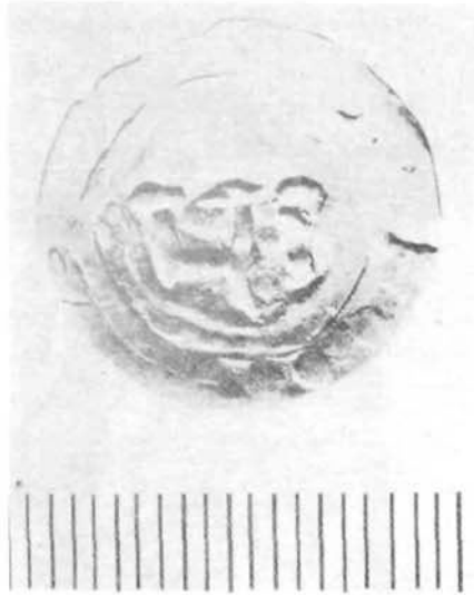
Fig. 3. Lavapura or Lopburi coin. Silver. Seventh Century A. D. Bangkok National Museum.