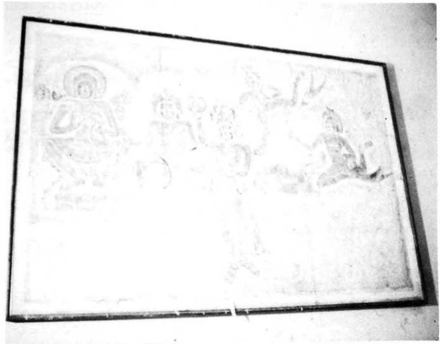
Above : Fig. 11. Rubbing of a stone bas-relief representing Buddha preaching to Hindu gods. The height of the Buddha is about 1.20 m. Eighth-Ninth century A. D. Dvaravati style. Bodhisattva Cave, Tambon Tab Kwang, Amphoe Kaeng Khoi, Saraburi.