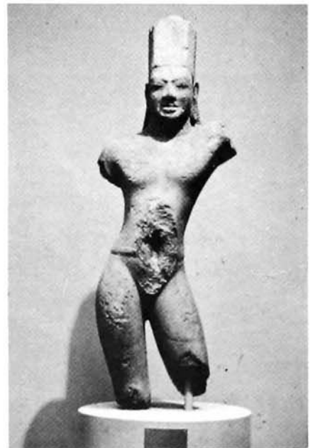
Right : Fig. 10. Vishnu or Krishna. Stone. Ht. 119 cm. Seventh-Eighth century A. D. Found at Sitep, Northern Central Thailand. Bangkok National Museum.