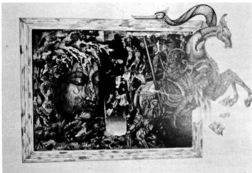
Untitled by Panya Vijinthanasarn, 1984.

At the end of the 60s, most of the Thai artists returned to Thailand from their studies abroad. This greatly influenced the expansion of the spectrum of representation of Thai modern to western or international tendencies with regards to their style,