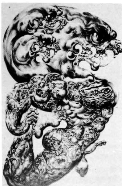
Water by Thawan Duchanee, 1983.

From this economic development other fields such as education in Thailand, profited as well. Furthermore, foreign cultural institutes like AUA, British Council and Goethe Institute assumed their activities in Bangkok through which Thai