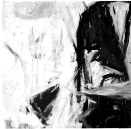
Left : Position and Civilization by Kamol Phaosavasdi, 1989.

In the 60s, foreign residents were the prime supporters and collectors of modern Thai art. These foreigners provided exhibition space and began to own private collections of Thai paintings.