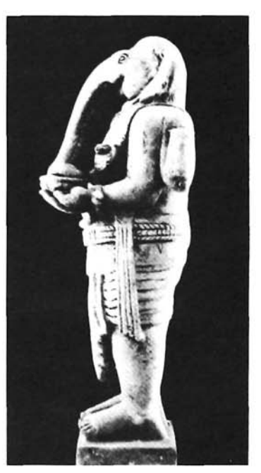
FIGURE 5. GANESHA OF MI-SON E.5. STONE. SECOND HALF OF THE SEVENTH CENTURY A.D.