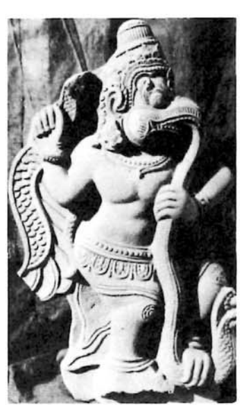
FIGURE 14. GARUDA FROM THAP-MAM. 12TH-13TH CENTURIES A.D.