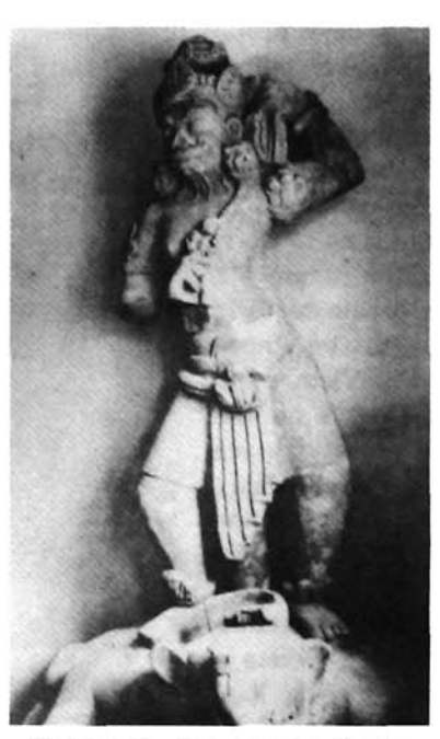
FIGURE 7. DVARAPALA (DOOR GAURDIAN) RIDING ON A BEAR AT THE SECOND GOPURA (GATE) AT DONG-DUONG. STONE. 875 A.D.