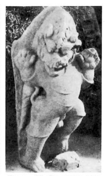
FIGURE 10. STANDING LION FROM TRA-KIEU. NINTH-TENTH CENTURY A.D.