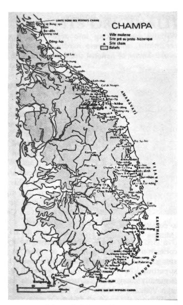
FIGURE 2. MAP OF CHAMPA