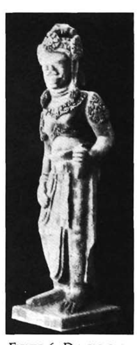
FIGURE 6. DHARMAPALA (THE LAW GAURDIAN) FROM A VIHARA AT DONG-DUONG. 875 A.D.