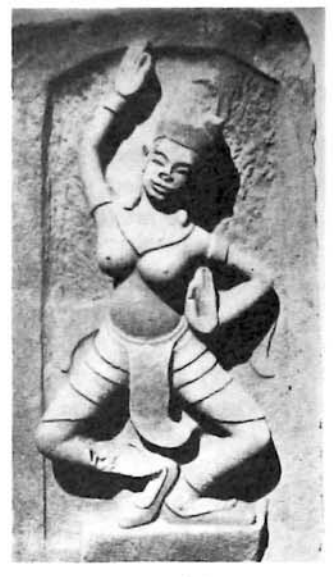
FIGURE 13. UNFINISHED DANCING FIGURE FROM THAPMAM. 12TH-13TH CENTURIES A.D.