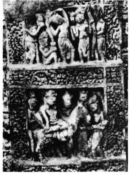
FIGURE 8. BASE OF THE PRINCIPAL SANCTUARY AT DONG-DUONG, SHOWING ON THE TOP PANEL: THE CUTTING OF THE HAIR OF THE BUDDHA, AND ON THE LOWER PANEL: THE GREAT DEPARTURE. STONE. 875 A.D.

for beauty, or for a charm, which is more humane. This profound change induces one to speak of a 'Second Golden Age' of Cham sculpture, the first having been represented by the works of Mi-son E. 1 style. However, such an idea is based on subjective considerations influenced by our Greco-Roman aesthetic. It is certainly permissible to doubt whether the Chams had in mind the same criteria because, during the 10th century, as well as the 9th century, they were not looking to create mere menial copies of their models.