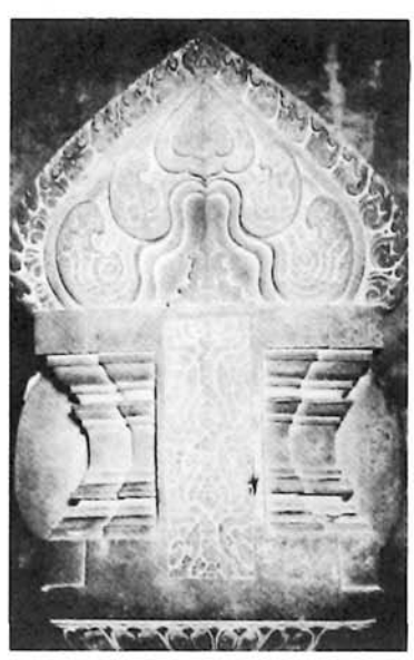
Figure 9. Base of the divinity of Po Nagar at Nha-Trang. 965 A.D.