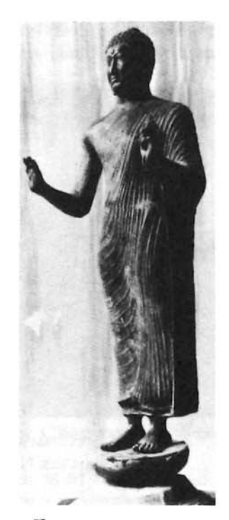
FIGURE 3. BUDDHA FOUND AT DONG-DONG. BRONZE. FIRST HALF OF THE FIFTH CENTURY A.D.