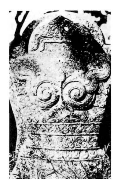
FIGURE 15. KUT. LATE CHAM ART

sources of inspiration, because these, as in Indonesia, were exhausted, and in addition Champa had been completely cut off from these sources because the control of maritime routes had fallen into other hands. Thus it is perhaps in the very final works that the true Cham aesthetic ideals appear. It is an art which is more concerned with grandeur, (and the ornaments which evidence this grandeur: it must not be forgotten that statues of divinities were also ornamented with real jewelry) than with correct physical anatomy (fig 15).