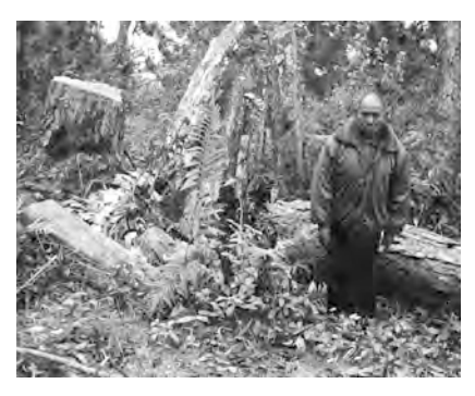
Logging operations (2002), dropping trees directly on menhir clusters