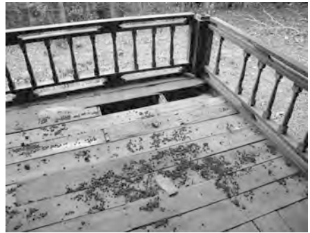
AFCP-funded sala (pavilion) at San Kong Phan (still closed to the public)

By the time the security situation had re-stabilized, the weathering and deterioration of the unused sala, which was largely open to the elements on three sides, were significant. The DAR evidently felt that it was insufficiently presentable, and there were no funds available under the original grant for the required repairs. The US Embassy were not aware of this imbroglio, and it was not until 2008 that a ranking Embassy staffer was able to get up to Xam Neua to arrange a formal turnover to the Houaphanh provincial governor.