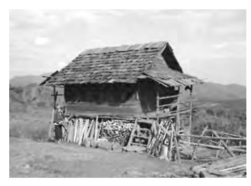
Tomb lid used as staircase landing stone, Ban Pacha (2002)

The most important deliverable of the first AFCP project was large site signage, which was installed at San Kong Phan. The signage design was largely based on Colani's drawing and photographs of exactly that same location, originally produced in 1932. The approximate size of the main panel was 1.5 \times 3 m, and the construction was of digitally printed UV and water-resistant vinyl glued to