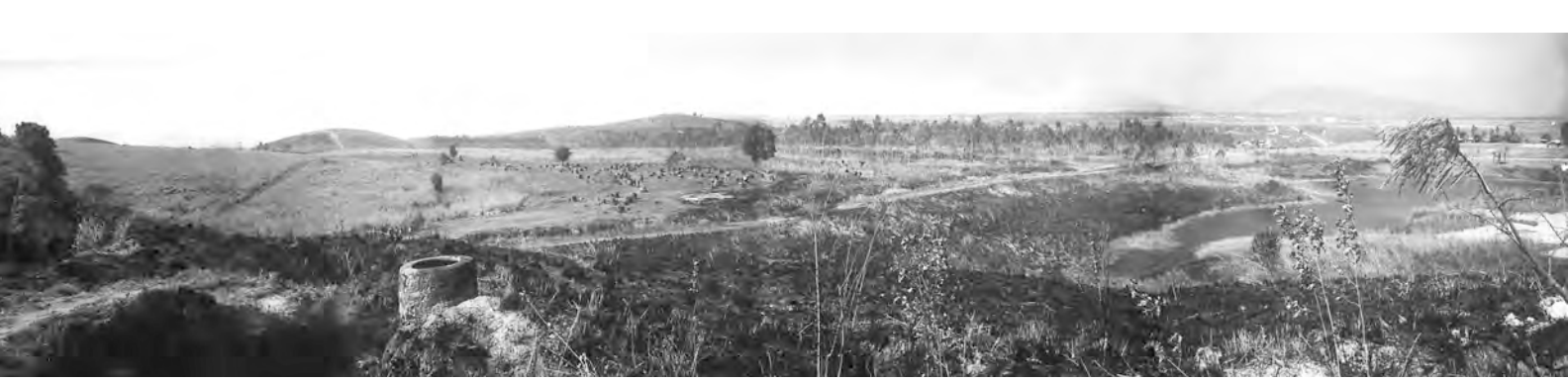
The much-better known Plain of Jars