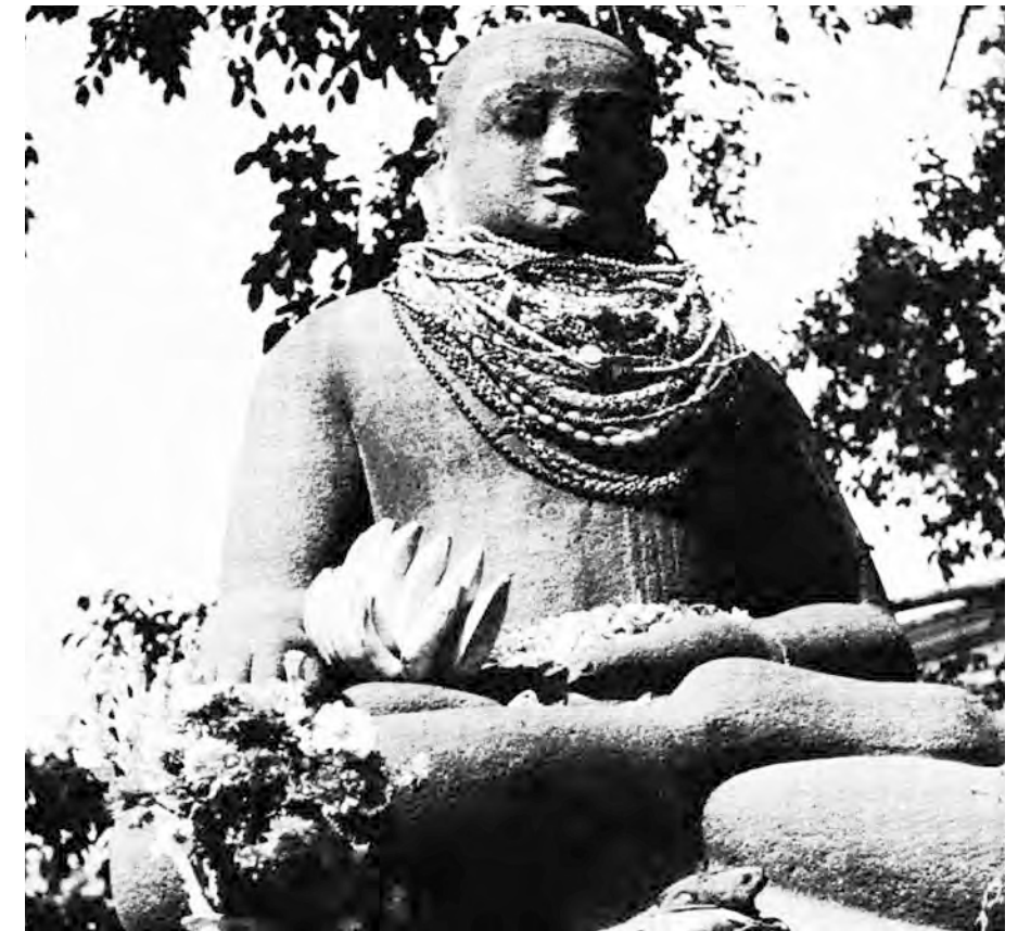
Fig 1: The statue of Joko Dolog, portraying Bharada, the mythical figure who – according to the tradition – drew the dividing line between the kingdoms of Janggala and Pañjalu in 1052.

18th century Balinese rulers took an active interest in the Majapahit ruins at Trowulan. During the Surapati insurgency (1686 - 1703) and