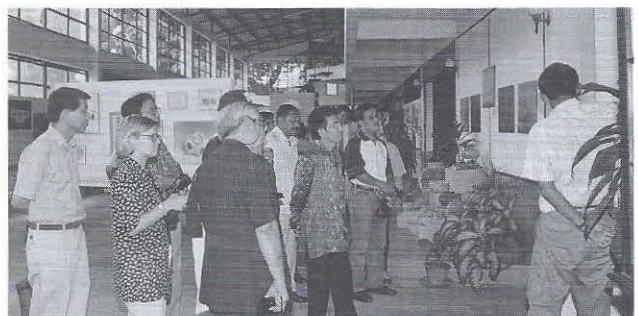
Visiting the Underwater Archaeology centre