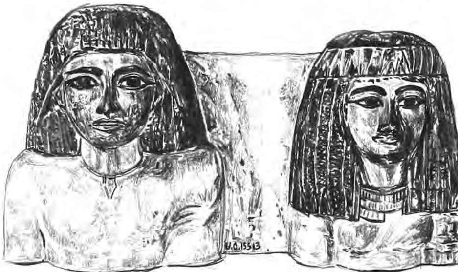
Painted dyad sculpture discovered by Sir William Flinders Petrie. Sketch by Sakulchat Chatrakul Na Ayudhaya

The exhibition, 'Excavating Egypt,' presents more than 220 items, some of which are dated over 5,000 years old, including jars, pots