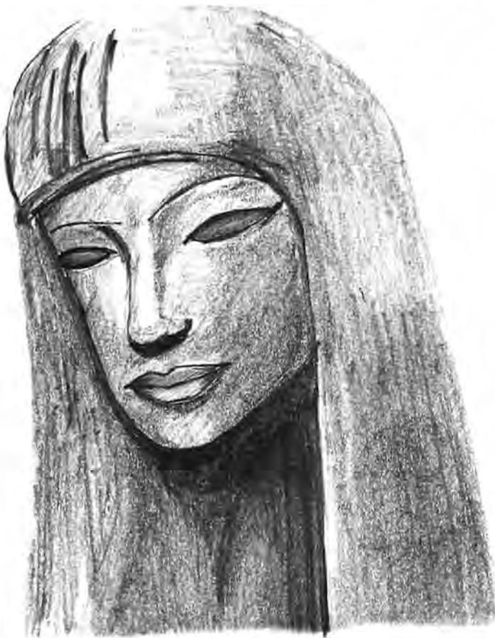
Face on a 3.62m statue of ancient pharaonic queen Tiya, wife of Amenhotep.

Meanwhile, deciphered documents and modern archaeological research have led scholars to believe that the kingdom of Kush up the