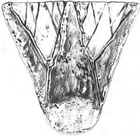
A lotus inlay faience in the collection of Sir William Flinders Petrie.