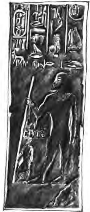
A part of the delicate false door of Neferinpu's tomb. Sketch by Wunnaporn Siangprasert

The excavated site includes a public town commerce centre that was also used for tax collection, and documentation of accounts and written