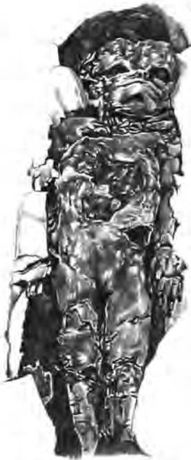
Sketch of one of the two mummified fetuses discovered in the tomb of Tutankhamun, based on an undated photo released by the Egyptian Supreme Council of Antiquities. Sketch by Sakulchat Chatrakul Na Ayudhaya

The mummified remains of the two still-born children were found during the 1922 discovery by Howard Carter. Some scholars believe that their mother was Ankhesenamun, only wife of Tutankhamun, and daughter of Nefertiti.