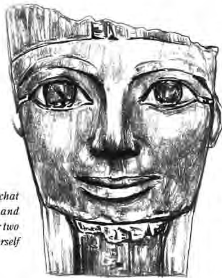
Hatshepsut and Thutmose III ruled together for two years before she appointed herself pharaoh.

E gyptian authorities recently identified a mummy discovered a century ago as the remains of Queen Hatshepsut, one of Egypt's most mysterious pharaohs.