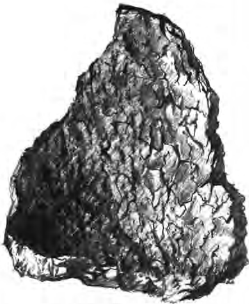
A shard of rare polished pottery found in Faiyum where archaeologists unearthed evidence of a farm settlement from 5200 B.C. Sketch by Wunnaporn Siangprasert

Egypt's ancient basic settlements have mostly been destroyed, and thus not much is known about them.