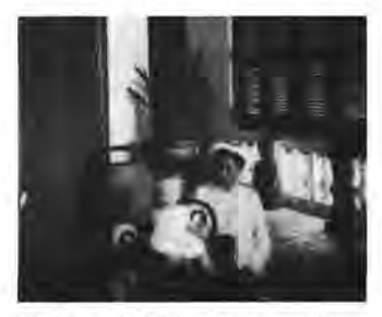
Vietnamese babysitter (amah) in traditional dress with hair turban (khan giai) and white tunic (ao ban than)