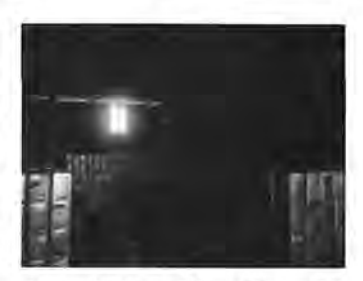
Storage for lamp oil, brand Crown Oil, produced by Shell or Dutch Petroleum, and distributed by APC through Speidel & Co.