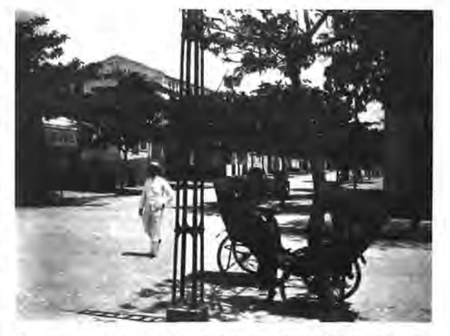
European quarter of Haiphong with the Hotel de Marseille and the Hotel de l'Europe (today the Huu Nghi Hotel) in the background