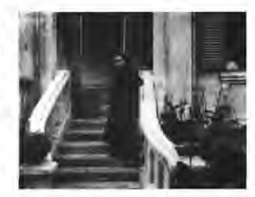
Vietnamese housekeeper clad in brown silk tunic (ao nam than). A silver necklace adorned with dragon motifs completes the dress