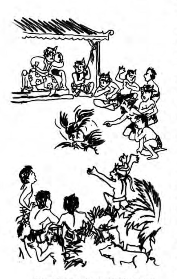
The cockfight as a microcosm of Balinese culture

When anthropologists Clifford and Hildred Geertz arrived in a small village on Bali in the late 1950s, they were outsiders. It was, Clifford Geetz wrote, 'as though we were not there. For them, and to a degree for ourselves, we were non-persons, specters, invisible men' (1973:412). Things changed ten days later when they visited their first cockfight.