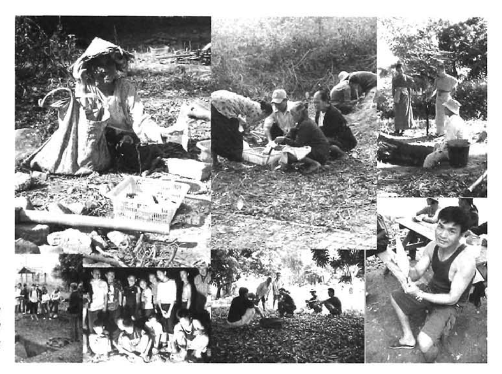
Village participation was crucial for us to better understand the different histories and explanations about the pasts of Viengkham.

and thoroughly examined. How old were they? Was it important at all, the age? And how about the value and the meaning? Was it changed because of the fact that the objects now were found during scientific circumstances and not by the rice farmers themselves, as happen usually? It soon became obvious that the age was not of great importance. Not in the sense that the older the better, but rather that every discussion concerning age related to Fa Ngum, the establishment of Lan Xang kingdom and the Phra Bang statue. If I was not given the answer 'oh, this must be from the time after Fa Ngum' or 'definitely older than Fa Ngum' an event or an object was always related to as more or less than hundred years ago.