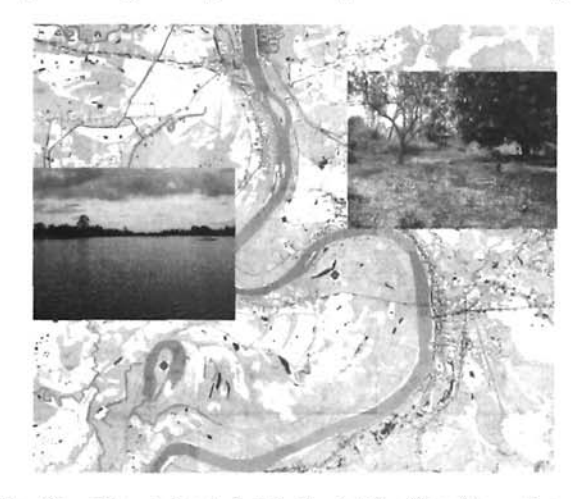
Ban Viengkham is located at the bend of the Nam Ngum river, with the old temple site Vat Kao to the right and the moated site Don Kang to the left, surrounded by Nong Seun, The excavations at Vat Kao was preceded by a georadar investigation and phosphate mapping.

Once upon a time, men forgot to provide offerings to Phaya Thaen, the king of heaven. He became so angry that he sent a big flood upon the earth. Three chiefs of mankind got on a boat, which floated to heaven, and pleaded with Phaya Thaen for forgiveness. After the flood, the chiefs came back to earth with a buffalo so that they could start cultivating rice, and continue to provide Phaya Thaen with offerings. Soon the buffalo died, but a plant grew out of its nose. The plant bore three enormous