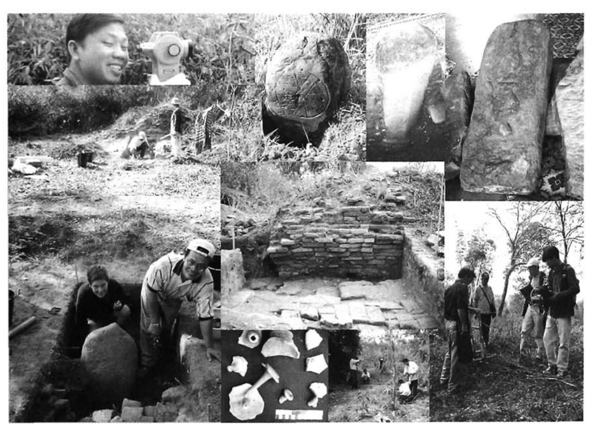
Archaeological excavations at Vat Kao. Finds and bricks date the temples to between 13th and 14th century.

It would have been easy to suggest that if you work in a context where the perception of time is circular, you should not bother about history. However, the paradox described above and the fact that the context is not purely Buddhist prevent us from leaving Laos out of any research in history or archaeology. Here, we could use the unilinear idea of time where the only true creation story is the scientific one based on archaeological evidence; but there are more stories to be told, and if the research field of archaeology should have a chance to survive, we must regard the different creations, the different views and versions of the past as equally important and necessary.