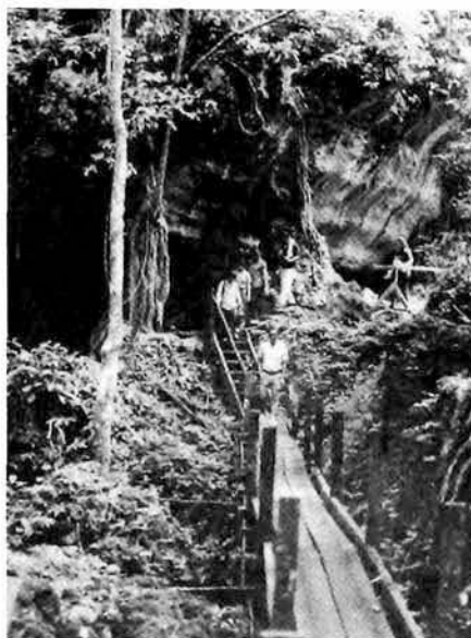
Going to the Niah Caves meant walking through forest areas.