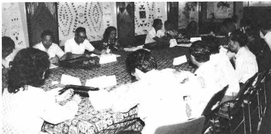
Workshop sessions were conducted in the Sarawak Museum at Kuching.