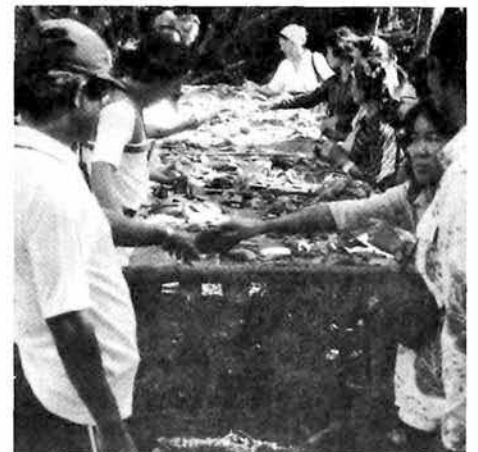
The sherds excavated in Kabong were laid out for inspection of the participants.