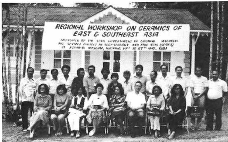
The participants to the Regional Workshop on Ceramics of East and Southeast Asia

A workshop on ceramics of East and Southeast Asia was held in Kuching, Sarawak, Malaysia on 18-26 May 1981. Sponsored by the SEAMEO Project in Archaeology and Fine Arts, the workshop prepared two project proposals to be incorporated into the SPAFA Development Plans for 1981-1986. One, a training programme, aims to meet the urgent need for trained personnel in ceramic research. The other, a research proposal, will trace the patterns of early maritime shipping and trade networks in Southeast Asia in the protohistoric and early historic times.