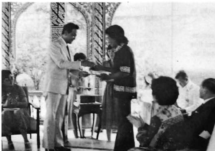
Many Southeast Asians benefited from the trainings conducted by the different SPAFA Sub-Centres.

During the initial phase of its operation, SPAFA formulated and carried out the proposal to conduct archaeological and environmental studies of the Srivijaya. Field studies are being conducted in Indonesia, Thailand and Malaysia. Another research proposed concerns the patterns of maritime trade in early historic times.