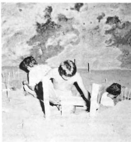
Training in prehistory involves working in excavations.