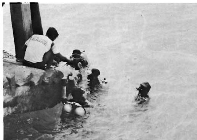
Underwater archaeology has been a major focus of the Thai SPAFA Sub-Centre.

SPAFA operates through a network of sub-centres established in Indonesia, the Philippines and Thailand with a Coordinating unit presently based in Bangkok. Each sub-centre specializes on a specific subject area of its choice.