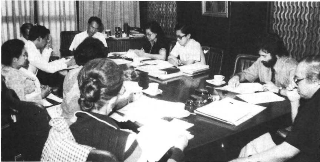
The Governing Board meets at least once a year to decide policy issues.

The officials of these different groupings that implement the project are listed in the following directory: