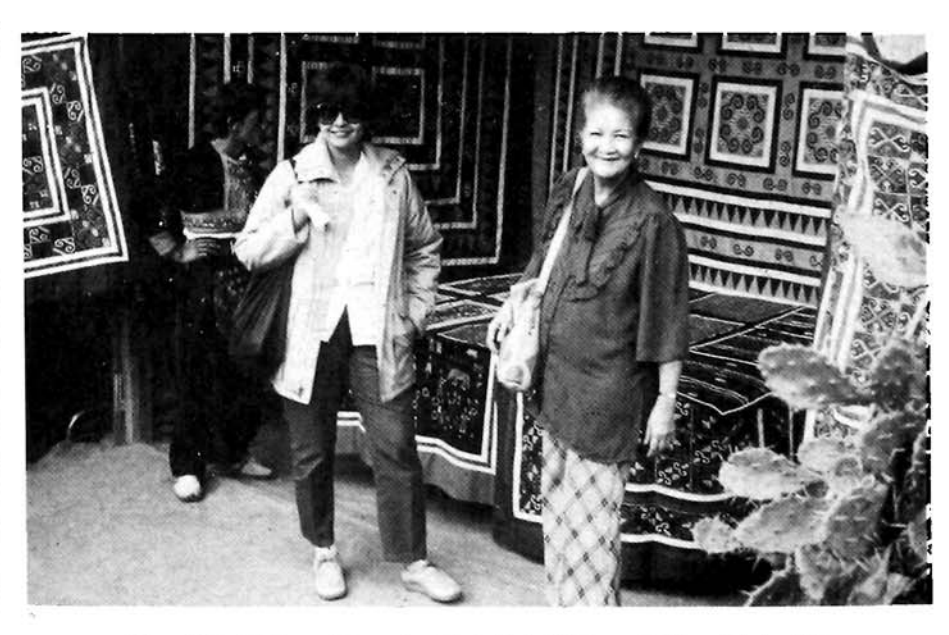
The Hill Tribe village in Doi Pui, Chiang Mai exhibited its handiwork.