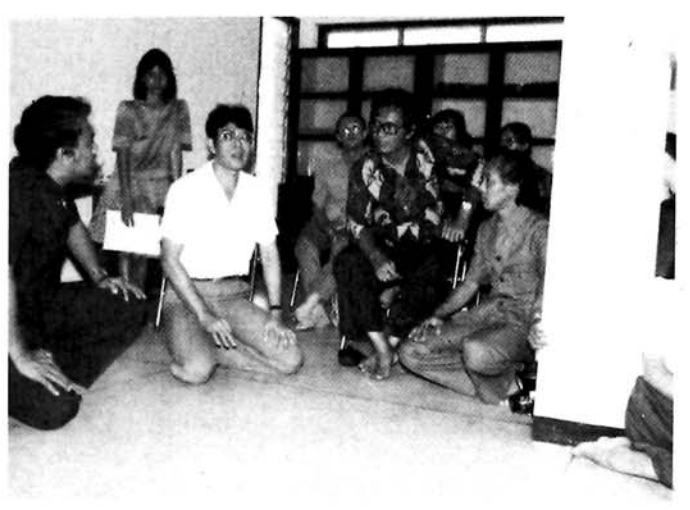
The visiting experts exchange views.

A programme of field trips to Early Man prehistoric sites in Central Java viz: Sangiran, Trinil, Patjitan and Sambungmacan, was organized by the SPAFA Sub-Centre for Archaeological Research. Prehistorians from the Philippines and Thailand joined their Indonesian counterparts in discussing future SPAFA programmes and activities in prehistory.