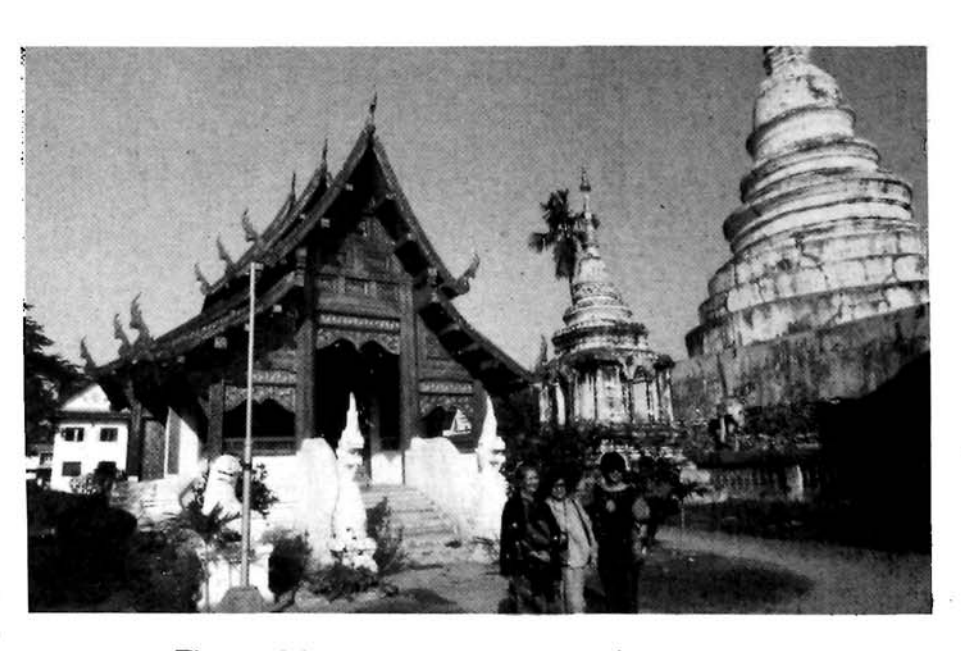
The participants visited Wat Prasing in Chiang Mai.