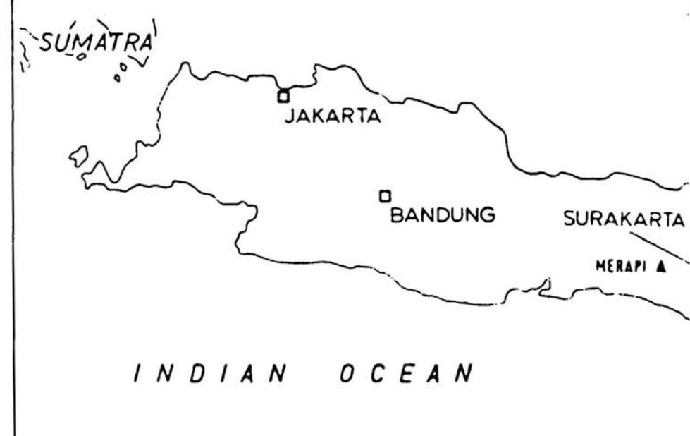
Fig. 1 The island of Java with the principal localities of fossil hominids and prehistoric stone artifacts

oldest river terraces in the region west of Pacitan (where most of the finds have been made) belong to the last phases of the Pleistocene; the younger terrace fills and scarps are Holocene, and the artifacts have not been derived from older sediments. What is even more important is that so-called Palaeolithic types of artifacts occur in surface assemblages away from rivers. In the literature these assemblages are rather vaguely categorized as "Neolithic"; it can be demonstrated geomorphologically that they do indeed belong to the Holocene. It is