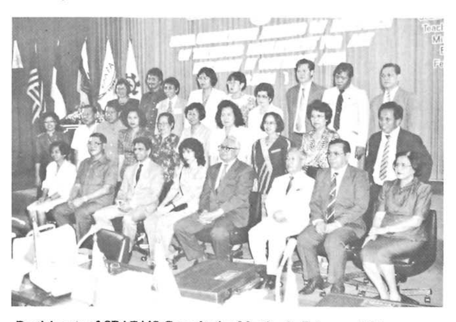
Participants of SPAFA'S Consultative Meeting in February 1990.

tertiary levels of education; the promotion and development of cultural arts heritage through appropriate methods of teaching art education; and the projected plan of networking art education programme information to Southeast Asian SPAFA Member Countries were also