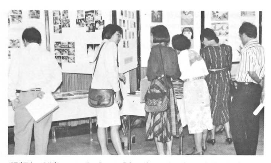
SPAFA exhibits on textbook materials and art education activities in pictures.

The month of February proved to be a busy period for SPAFA's