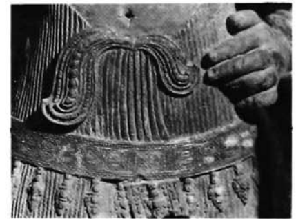
Fig. 7 Because of its excellent workmanship, one is tempted to think this statue must have stood at the most important and sacred tower of Prasat Kampaeng Yai.

Museum of Phnom Penh, Cambodia) and the two Bayon Style bronze dvarapala, more or less broken and kept at the Arakan Temple, Mandalay, Burma. He says that though they are larger than our bronze statue from Prasat Kampaeng Yai, they do not present comparable problems for conservation.