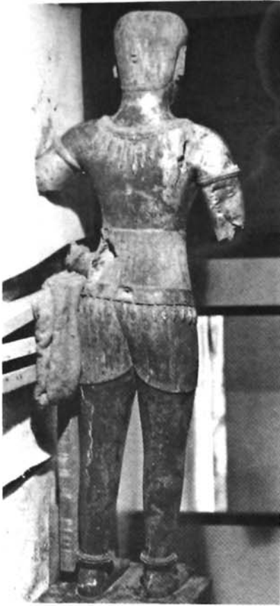
Fig. 2 The missing “butterfly knot” on the back of the statue’s belt characterizes the Khmer Baphuon style.

is typical of the Khmer Baphuon style as it curves down deeply on the abdomen, and rises rather high on the back. The “butterfly knot” on the back of the belt characterizes the Khmer Baphuon style. It was probably cast apart and then joined to the body but has later disappeared (Fig. 2).