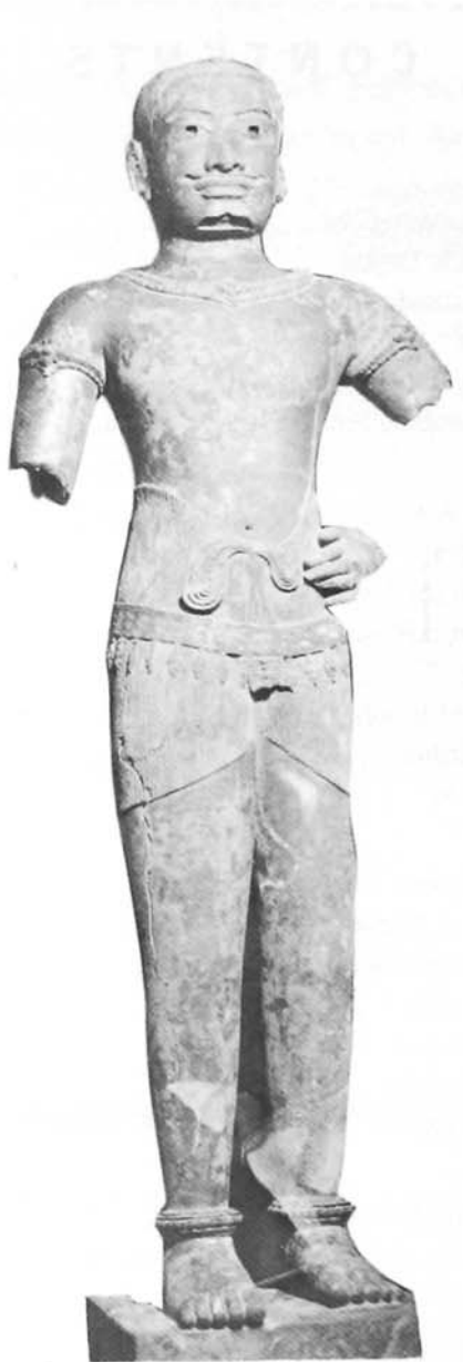
Fig. 1 The 140 cm. high bronze statue found at Prasat Kampaeng Yai in the province of Sisaket, northeast of Thailand.

Interestingly, all the prang are built in bricks but the pediments, lintels and door-columns as well as