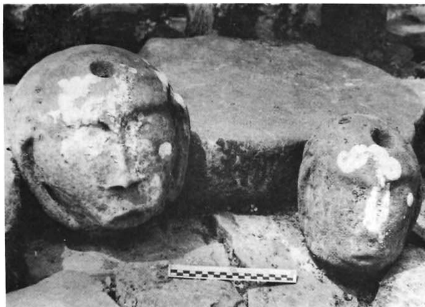
Human head statues from Onozitoli.

The menhir statue of Onowembo Telemaera still stands in situ , near the house of the chieftain. It is in association with other stone structures,