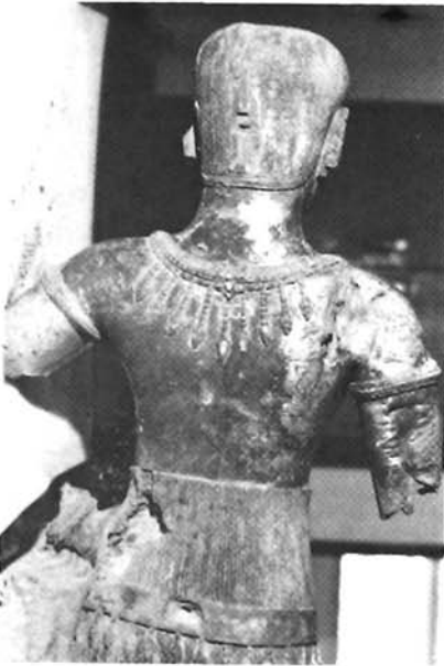
Fig. 5 The cracks on the statue may have resulted from the internal pressure of the earth, caused by the corrosion of the iron axis inside.

gana (attendants of Siva). Because of his loyal services, Siva allowed Nandikesvara to change his primitive appearance, which resembles a monkey, to the likeness of Siva.