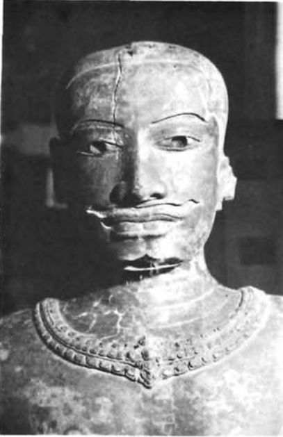
Fig. 4 The statue's face clearly indicates that it was inlaid with another type of metal. The technique of using more precious metals, such as gold or silver, as inlay for eyebrows, eyes, moustache and beard was typically used in the Khmer Baphuon style.