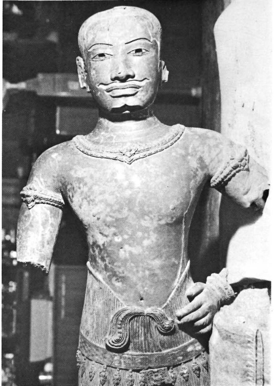
Fig. 3 Because of its attitude and gesture, this statue could be identified as a dvarapala (door-guardian).

1. The statue at Kampaeng Yai Sanctuary might be holding a small club vertically. There are many bronze examples of Khmer divinities holding a club vertically. These statues date back to about the 12th century A.D.