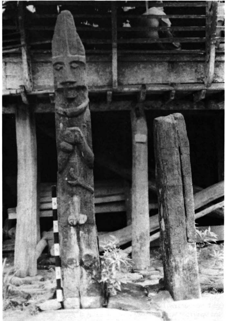
A menhir statue from Onowembo Telemaera.