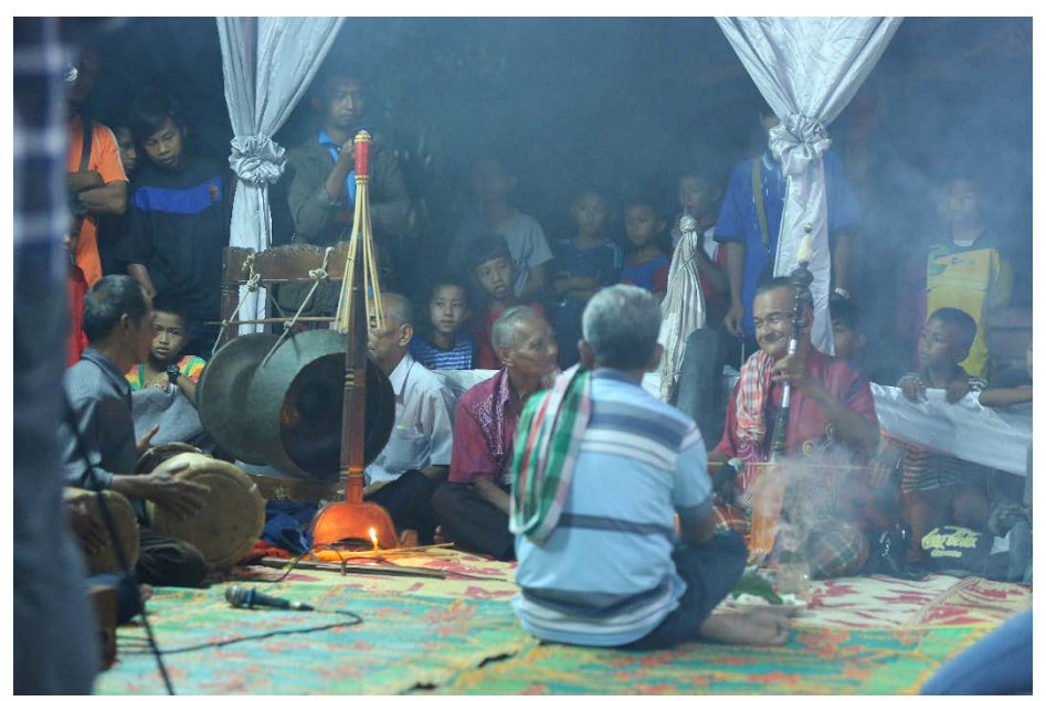
Fig. 1 Buka panggung (opening the theatre) ceremony, blessing the rebab, drums and gongs.

The audience crowded around the four sides of the performance space as the the buka panggung (opening the theatre) ritual took place (Figure 1). Prayers were chanted by the spiritual leader. The instruments were blessed with incense, candles were placed on the drums, while pop rice ( bertih ) was scattered at the four corners of the stage area to ensure that no mishap would occur during the performance. The opening songs ( lagu Bertabuh ) were then played to announce the beginning of the show.