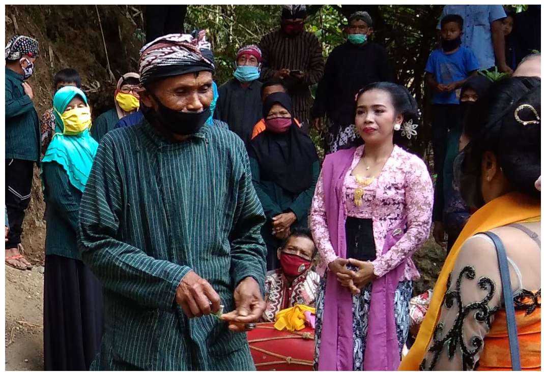
Fig. 12 Traditional elders give money ( saweran ) to senior Tayub dancers to start the Tayub dance performance at Sendhang Milodo.

The normative rules of the presentation structure bind every part of the Tayub dance. The Tayub dance at Dusun Tukluk, Tambakromo Village has three parts, namely tayuban , jangrungan , and bendrongan . The Tayub dance at Sendhang Milodo began with traditional elders giving money ( saweran ) to senior Tayub dancers (Figure 12). Then, after placing offerings and reading the incantation, traditional elders gave money to the senior Tayub dancer. After that, the Tayub players presented the Tayub dance at Sendhang Milodo.