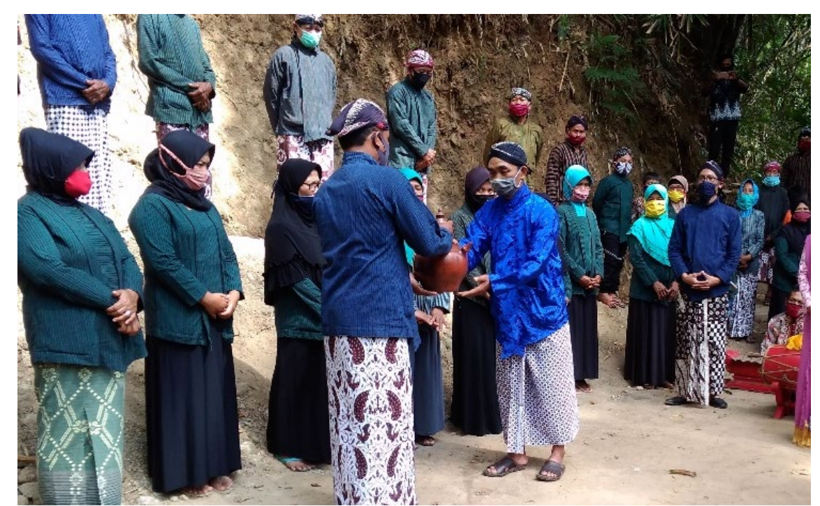
Fig. 10 Handing over a kendhi filled with water from Sendhang Milodo.

The events above show that water occupies a crucial position in life. Philosophically, Javanese people believe that water is essential to rituals as a repellent, purification, and a source of peace. In