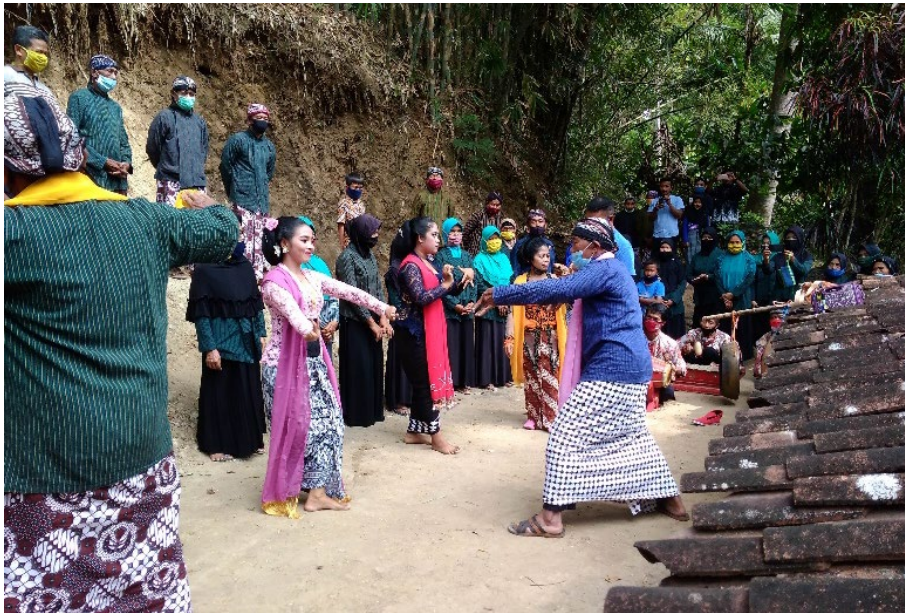
Fig. 14 The janggrungan part of the Tayub dance performance at Sendhang Milodo.

The first art of the Tayub dance performance is the Tayuban , which means that the Tayub dancers dance with a female dance movement pattern and are not accompanied by pengibing <sup>4</sup>. The variety of motion used in the tayub section is gambyongan <sup>5</sup>. This initial part can be done with various gendhing (music with gamelan ensemble in Javanese) (Figure 13).