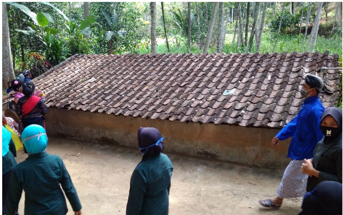
Fig. 1 A building in which there is a groundwater source named Sendhang Milodo.