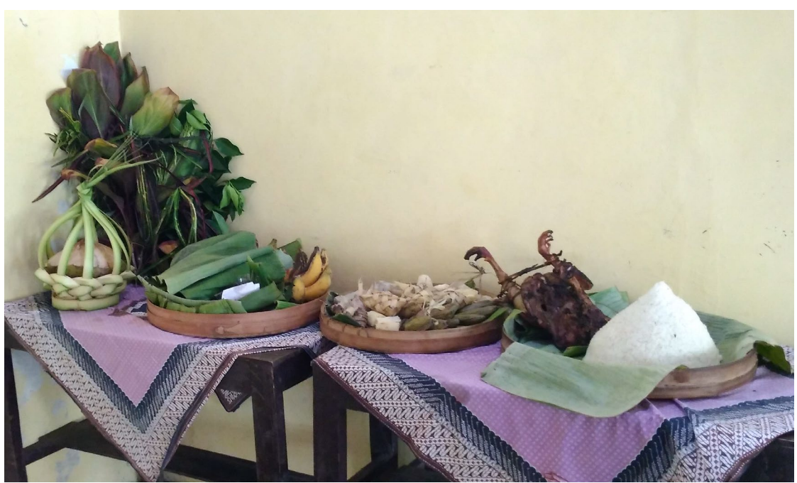
Fig. 3 The main offerings in the Village Purification ritual which is placed in the Bale Dusun Tukluk, Tambakromo Village.

Sub-Village Hall, the Tukluk Sub-Village Head welcomed the Village Head and all local leaders who were then asked to sit in the Bale Dusun. There are two types of offerings placed in this area. The main offerings are inside the Bale Dusun (Figure 3), while the supporting offerings are in front of the Bale Dusun terrace. Based on an interview with Sadimo<sup>2</sup>, the primary function of offerings for the community is a means to give offerings to their ancestors. In this case an offering to Mbok Roro Pithi as the ancestor of the Dusun Tukluk community, Tambakromo Village. Supporting offerings function as a form of gratitude to the sendhang as a source of water on which the villagers live (Sadimo interview 8 October 2020).