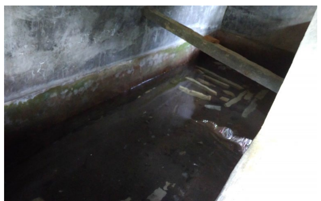
Fig. 2 Sendhang Milodo, which is believed to be the residence of Mbok Roro Pithi, ancestral residents of Dusun Tukluk, Tambakromo Village.

Evidence for a religious and belief system is shown by the procession of all elements of society in following the tradition of taking water from the Sendhang Milodo. This part of the procession is powerful because the village head and members of local leadership follow the procession. This section begins with welcoming the arrival of the village head and local leaders at the Bale Dusun Tukluk (Tukluk Sub-Village Hall) in Tambakromo Village. After arriving in front of the Tukluk