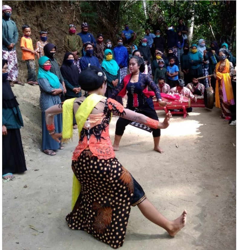
Fig. 15 The bendrongan part of the Tayub dance performance at Sendhang Milodo.

The second part of the Tayub dance performance is janggrungan , or what is often referred to as ngibing (Figure 14). This section begins with a community member who gives the saweran and then asks for a gendhing . In the janggrungan section, community members can dance with Tayub (in Java, it is called pengibing ). Every citizen can ask for a gendhing by giving a saweran . Residents always give saweran to senior Tayub dancers. Local leaders are the top priority for dancing ( ngibing ) with the Tayub dancers and other villagers. Before the Covid-19 pandemic, this section tended to be free with an unlimited duration of presentation depending on whether the audience still wanted to dance or not. As a form of social dance, in the janggrungan section, physical contact is the main feature. The pengibing (audience) when dancing or giving money is allowed to touch any part of the dancer's body. Therefore, due to the Covid-19 pandemic, the janggrungan section has experienced a significant reduction in the duration of the presentation, which is limited to two gendhing . Helpers are encouraged to keep wearing masks and keep their distance to avoid physical contact.