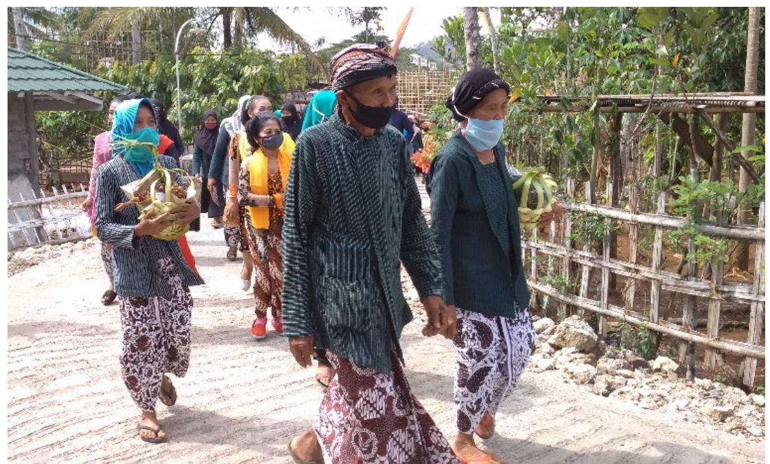
Fig. 4 The bearer of offerings in the procession to the Sendhang Milodo.