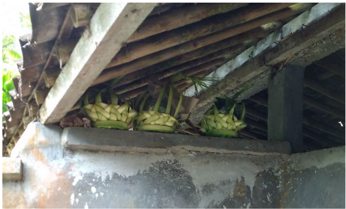
Fig. 8 The offerings brought during the procession are placed on the parapet between the second and third rooms in Sendhang Milodo. Source: Photo by R. M. Pramutomo, 2020.

The Sendhang Milodo ritual begins with the laying of offerings by traditional elders. After the procession arrives at Sendhang Milodo, the traditional elders and offering bearers enter the second room, which is south of the third room. The offerings are placed on the dividing wall between the second room and the third room (Figure 8). The offering bearers give the offerings they bring to the traditional elders. After that, they take turns drinking Sendhang Milodo water (Figure 9). According to Prihono (interview 8 October 2020) drinking is an expression of gratitude for the sustenance given, namely the source of water which is very much needed in the life of an agrarian society. At that time, the kendhi brought from Bale Dusun Tukluk was also filled with Sendhang Milodo water. The kendhi , which contains Sendhang Milodo water, will then be brought back to Bale Dusun through a handover process with local leaders (Figure 10). Kendhi and Sendhang Milodo water will