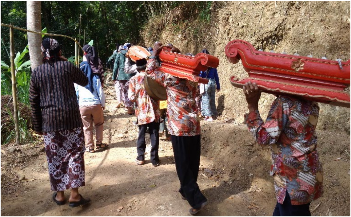
Fig. 6 Villagers carry the gamelan used in the Tayub dance performance at Sendhang Milodo.

elderly have a significant position from starting to bring offerings to becoming one of Tayub 's dancers.