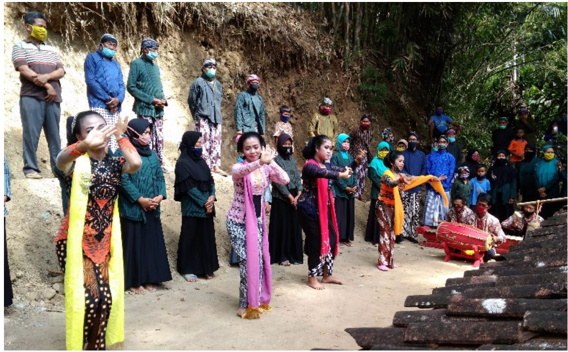
Fig. 11 Tayub dance performance at Sendhang Milodo.

Sendhang Milodo became the location chosen by the residents of Dusun Tukluk, Tambakromo Village, as the place for the Tayub dance to be held in the Village Purification ritual. Sendhang Milodo is a groundwater source that has the closest distance to Dusun Tukluk. It should be remembered that an agrarian society highly respects sendhang as a source of life. Water is one of the basic needs that support life (Firmansyah 2013: 5; Dwimarwati and Djuniarti 2017: 330–338; Suparta 2021: 57–59). This is what makes Sendhang Milodo a purified or sacred place. In addition, Mbok Roro Pithi is an ancestor that the residents of Dusun Tukluk believe resided in Sendhang Milodo. This is the basis for choosing the Sendhang Milodo as the venue for the Tayub dance performance in the Village Purification ritual. The purpose of holding the Tayub dance in the Village Purification ritual is as an expression of gratitude for the grace given by God through the Sendhang Milodo (Prihono interview 8 October 2020).