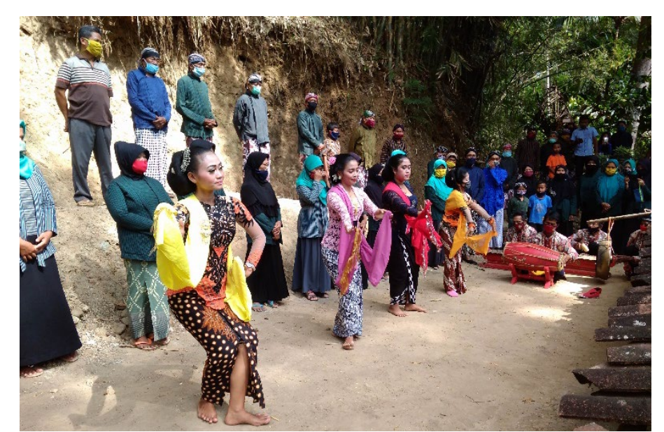
Fig. 13 The first part of the Tayub dance performance at Sendhang Milodo.

The first art of the Tayub dance performance is the Tayuban , which means that the Tayub dancers dance with a female dance movement pattern and are not accompanied by pengibing <sup>4</sup>. The variety of motion used in the tayub section is gambyongan <sup>5</sup>. This initial part can be done with various gendhing (music with gamelan ensemble in Javanese) (Figure 13).