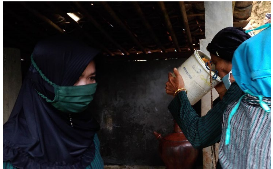
Fig. 9 One of the villagers who bring offerings drinking water from Sendhang Milodo.

complement the main offerings that have previously been arranged at Bale Dusun Tukluk. The traditional elders start burning incense and chanting mantras after the procession of placing offerings and taking water was complete.