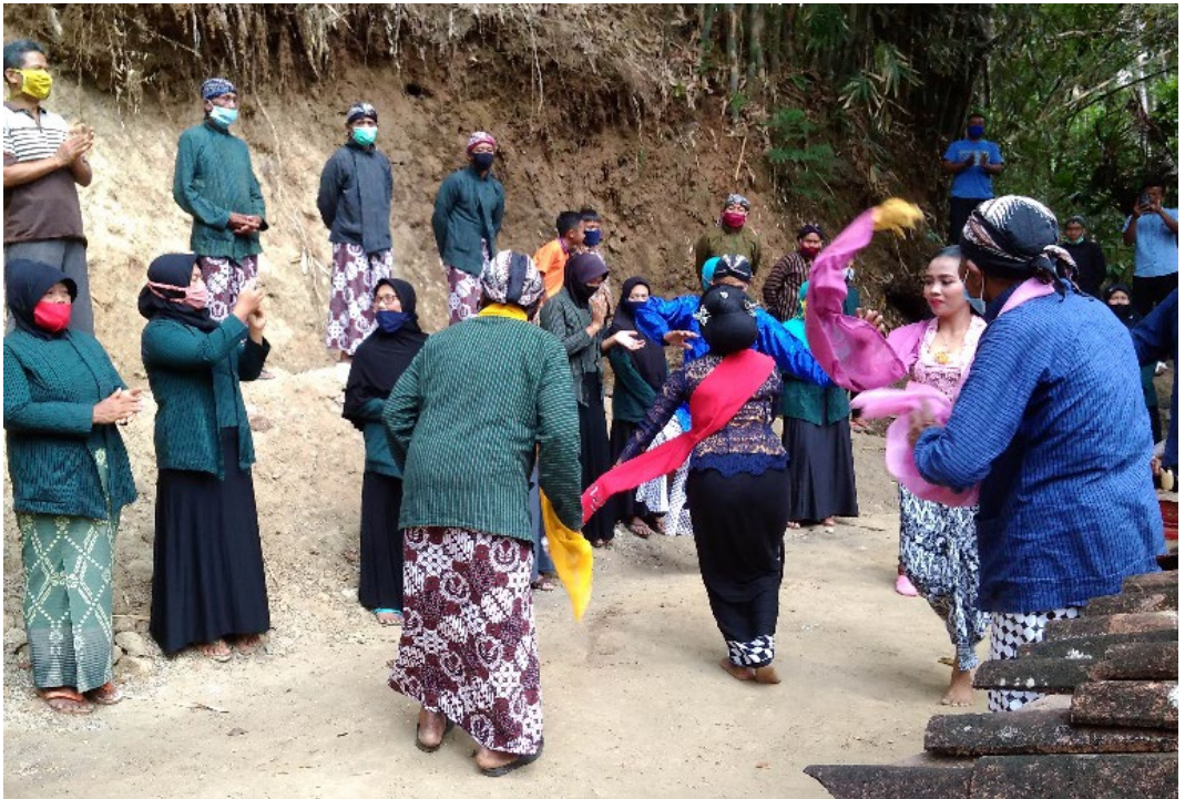
Fig. 16 The atmosphere of togetherness in the Tayub dance performance at Sendhang Milodo.

The movement patterns used in the Tayub dance in the Village Purification ritual in Tambakromo are aesthetically uncomplicated. This is indicated by the absence of normative rules that bind the motion patterns used, especially in the janggrungan section, where everyone is allowed to dance with an unspecified movement pattern. Like the Village Purification ritual dance in general, aesthetic presentations are not given much attention but prioritize interests or goals (Lupitasari 2019: 371). This shows that Tayub dance as a form of social ritual dance is vigorous. Social interaction between citizens can provide a picture of togetherness that can be used as a form of relationship (Figure 16).