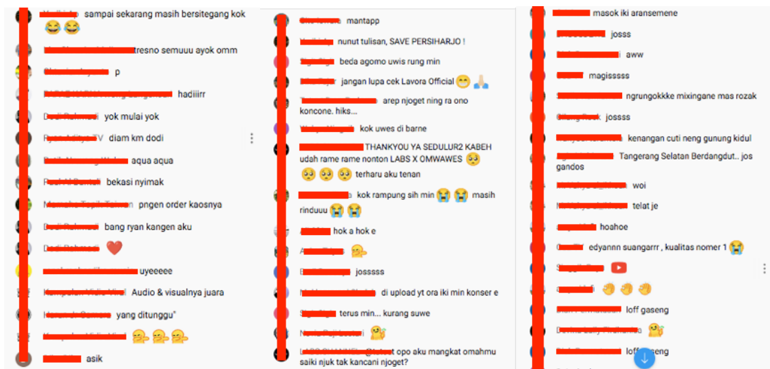
Fig. 4 The chat box of YouTube while OM Wawes perform online.

streaming (Gaseng OM Wawes, personal communication, August 21, 2020). However, Gaseng also said, "The audience has a big influence on online Dangdut performances," so that is why the interaction for the audience has been organized as best as possible. OM Wawes accommodated the audience through a comment chat box during the performance. OM Wawes and the team responded to the comment after one song was sung. Gaseng's statement also reminds me that audiences that were previously visible and easily interacted need to be treated differently in live streaming. The chat box is a regular feature provided by YouTube. The interactions were also everyday conversations in many chat boxes, but the audience acted differently.