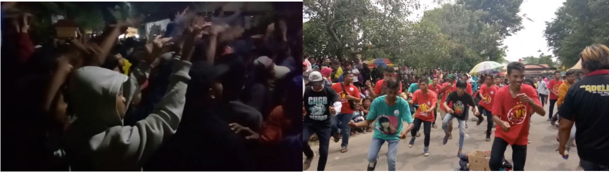
Fig. 1 Audiences responds the song with their dance.

Figure 1 shows us audience responses to Dangdut. In the left image, the audience responds to the beat with a movement in the song's chorus. Audiences danced together while the singer sang. On the right side, the audience responded to the whole song with a specific choreography. It shows that there was a performance inside the performance. When I was there, I watched two performances—the actual Dangdut performance with the singer and the audience's response to Dangdut performance with their choreography—simultaneously. It was terrific and hypnotizing at the same time.