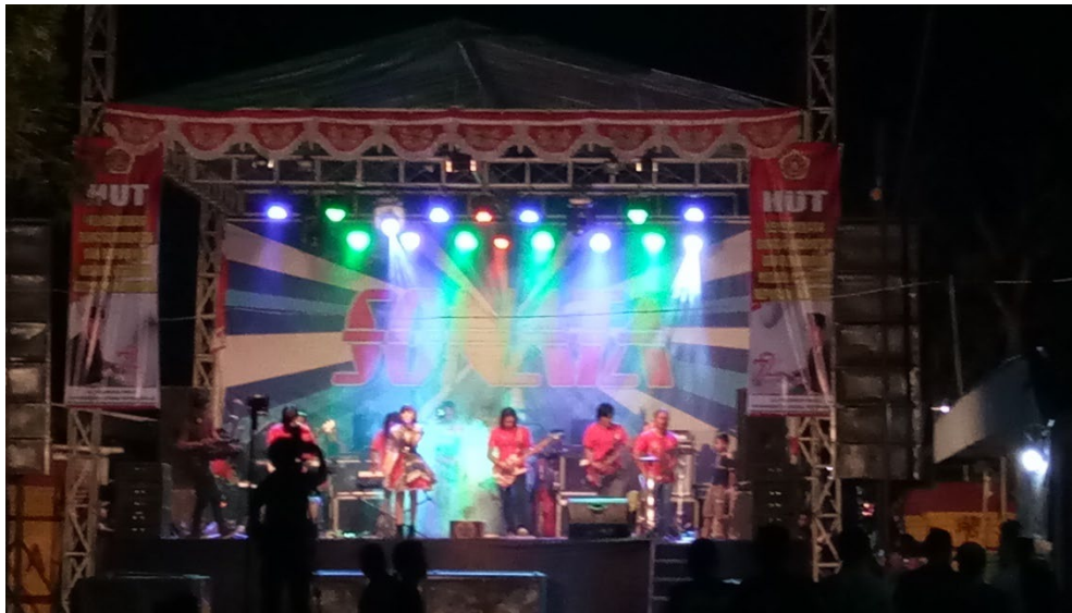
Fig. 2 Melayu Orchestra Sonata performed in Jombang, East Java.

cameras, spectacular visuals in their background, and other camera technicalities, for instance, zoom in, zoom out, focus and blur, etc. Those techniques are impossible to apply in Dangdut's live performance.