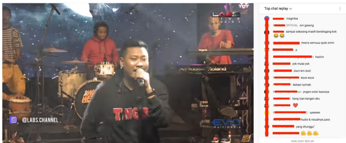
Fig. 3 Screen captured of OM Wawes live streaming performance.

According to Figure 2, live performances in Dangdut music did not have a shooting technique. The audience watched the dangdut performance without the camera facilities that live streaming has. Many performances also do not put spectacular visuals, for instance, bumper videos, trueview videos—longer formats with more complex messages—, motion pictures, and video clips as their stage background. In short, the camera's point of view is a vital element in live streaming. It is the way that should be taken because, in the live streaming concept, temporal is the only element they have, while spatial is absent. In front of the screen, the audience watched the music performance from their mobile phones or laptops without delay to enjoy the show. The audience can watch from anywhere because live streaming has no spatial co-presence.