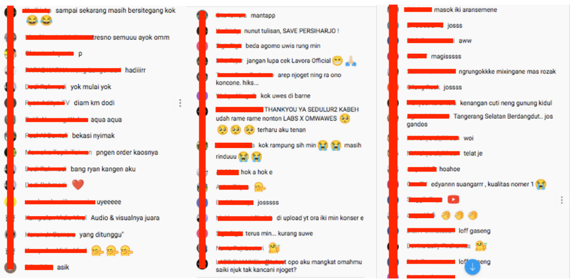
Fig. 4 The chat box of YouTube while OM Wawes perform online.

streaming (Gaseng OM Wawes, personal communication, August 21, 2020). However, Gaseng also said, "The audience has a big influence on online Dangdut performances," so that is why the interaction for the audience has been organized as best as possible. OM Wawes accommodated the audience through a comment chat box during the performance. OM Wawes and the team responded to the comment after one song was sung. Gaseng's statement also reminds me that audiences that were previously visible and easily interacted need to be treated differently in live streaming. The chat box is a regular feature provided by YouTube. The interactions were also everyday conversations in many chat boxes, but the audience acted differently.