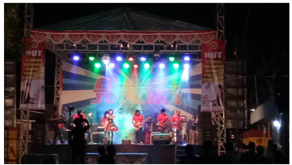
Fig. 2 Melayu Orchestra Sonata performed in Jombang, East Java.

cameras, spectacular visuals in their background, and other camera technicalities, for instance, zoom in, zoom out, focus and blur, etc. Those techniques are impossible to apply in Dangdut's live performance.