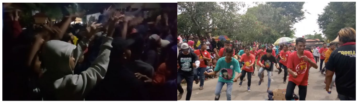
Fig. 1 Audiences responds the song with their dance.

Figure 1 shows us audience responses to Dangdut. In the left image, the audience responds to the beat with a movement in the song's chorus. Audiences danced together while the singer sang. On the right side, the audience responded to the whole song with a specific choreography. It shows that there was a performance inside the performance. When I was there, I watched two performances—the actual Dangdut performance with the singer and the audience's response to Dangdut performance with their choreography—simultaneously. It was terrific and hypnotizing at the same time.