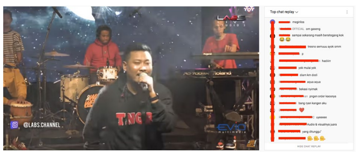
Fig. 3 Screen captured of OM Wawes live streaming performance.

According to Figure 2, live performances in Dangdut music did not have a shooting technique. The audience watched the dangdut performance without the camera facilities that live streaming has. Many performances also do not put spectacular visuals, for instance, bumper videos, trueview videos—longer formats with more complex messages—, motion pictures, and video clips as their stage background. In short, the camera's point of view is a vital element in live streaming. It is the way that should be taken because, in the live streaming concept, temporal is the only element they have, while spatial is absent. In front of the screen, the audience watched the music performance from their mobile phones or laptops without delay to enjoy the show. The audience can watch from anywhere because live streaming has no spatial co-presence.