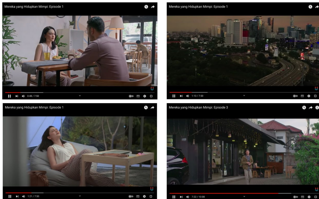
Fig. 1 Screenshots of scenes set in Jakarta (left to right and top to bottom) depicting Vei at a café, Jakarta establishing shot, Vei at home, and Rai walking away from the café. Source: MYHM (Mereka yang Hidupkan Mimpi: Episode 1 [web series], 2018; Mereka yang Hidupkan Mimpi: Episode 3 [web series], 2018).

Toward the end of MYHM , the story focus shifts to Rai who returns to Jakarta after his encounter with Vei in Singapore. He stumbles upon a café. As Rai waits for his coffee, he catches a glimpse of Vei, but before he can step forward to greet Vei he sees the ring on her finger and her fiancé.