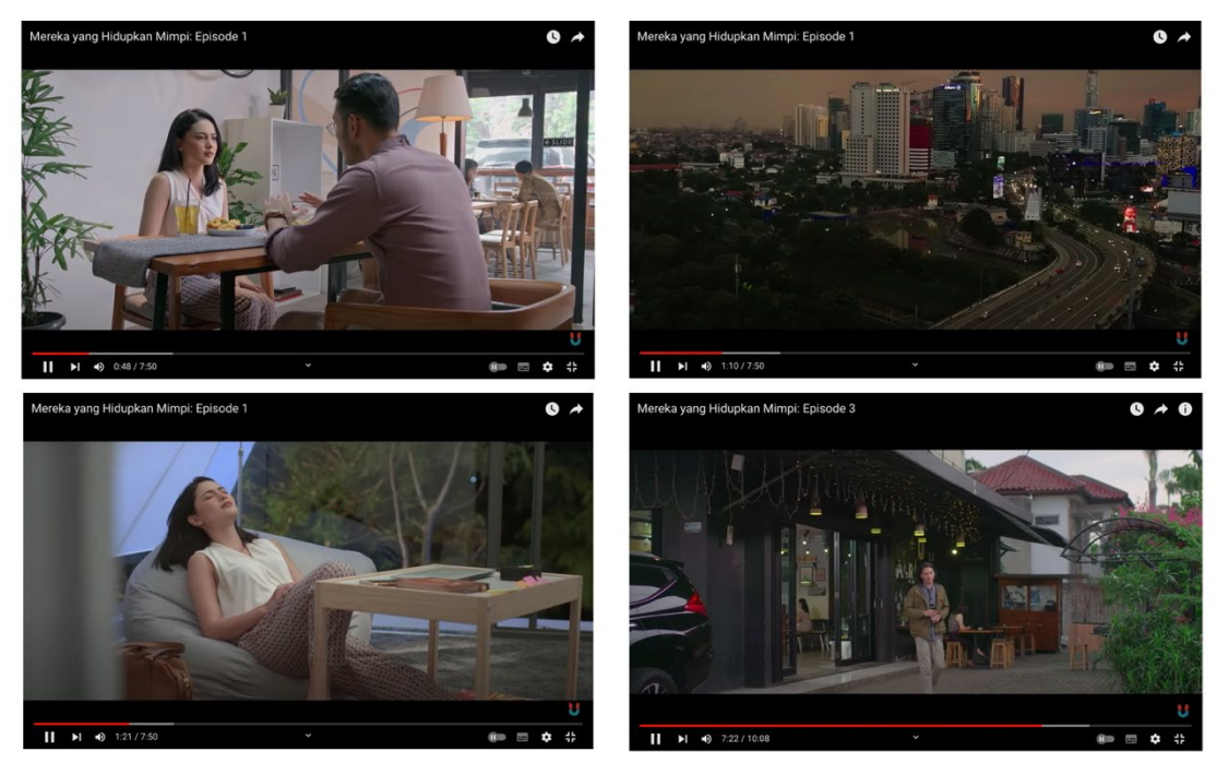
Fig. 1 Screenshots of scenes set in Jakarta (left to right and top to bottom) depicting Vei at a café, Jakarta establishing shot, Vei at home, and Rai walking away from the café. Source: MYHM (Mereka yang Hidupkan Mimpi: Episode 1 [web series], 2018; Mereka yang Hidupkan Mimpi: Episode 3 [web series], 2018).

Toward the end of MYHM , the story focus shifts to Rai who returns to Jakarta after his encounter with Vei in Singapore. He stumbles upon a café. As Rai waits for his coffee, he catches a glimpse of Vei, but before he can step forward to greet Vei he sees the ring on her finger and her fiancé.