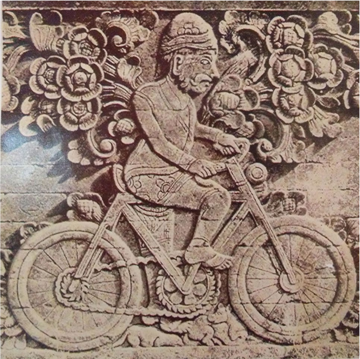
Fig. 2 The embodiment of the relief in 1904, a photo taken at the Buleleng Museum.