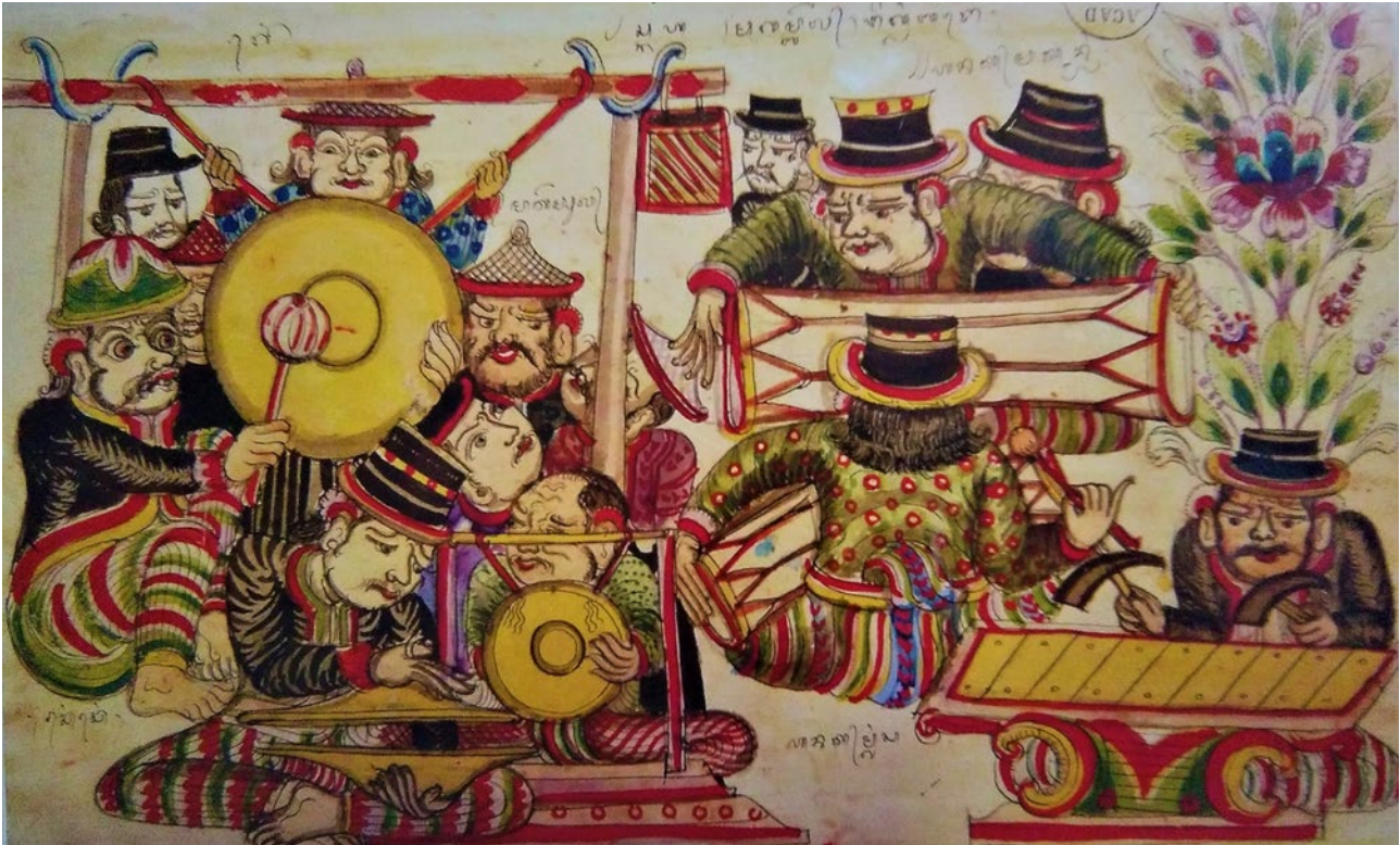
Fig. 4 Painting entitled “The Musicians Accompanying the Barong Performance”. Photo taken from the Buleleng Museum. Source: Dwija Putra, 2019.