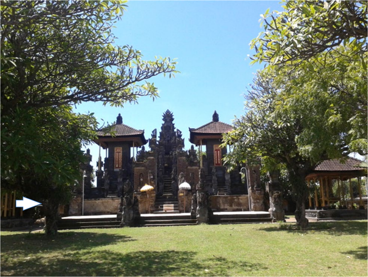
Fig. 1 Madué Karang Temple with the “Man on a Bicycle” relief, is on the left wall of the photo display; as indicated by the arrow, the relief is not visible from the front view of the temple.

The presence of foreign nations, particularly European colonisation, specifically the Dutch, had an impact and gave birth to a new chapter in the history of Balinese art. With its modernization, Dutch colonisation altered all aspects of Balinese life, including art and culture. With its introduction, Balinese art was divided into two directions: the continuation of traditional arts and the acceptance of modernism’s influence by introducing new idioms in its visualisation (as commodities). As a result of modernism, artistic activities focused on religious ceremonies and rituals have become more secular. As a result, the group essence of traditional art began to erode, giving way to more unique and individualised approaches. Then, through relief art, modern influences invaded the temples (holy places), which no longer feature story scenes or themes related to moral, ethical, and “ dharma ” teachings. The stories in these newer reliefs would be based on real life or on events that occur on a daily basis.