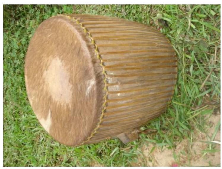
Fig. 13 The Cu'r drum of the Pa Ko.

During gong performances, the Cu'r drum is played by two individuals, each holding a stick and striking the drum on their respective sides. This technique produces various rhythms, incorporating skilled and intricate hand techniques such as strokes and rolls on the drumheads. The drums are used by men and serve the primary function of accompanying dances and harmonizing with other musical instruments. They are frequently performed in sacred spaces of the Ta Oi people. In-depth interviews reveal that not only the Cu'r drum, but most of the instruments used by the Ta Oi people adhere to specific principles and functions. Expert 2 emphasized that the Ta Oi people believe that certain musical instruments house their own deities (Jang), thus the use of any instrument in specific spaces is regulated. While some entertainment instruments like flutes may be used more freely in cultural programs, they are not employed in the rituals of the Ta Oi people.