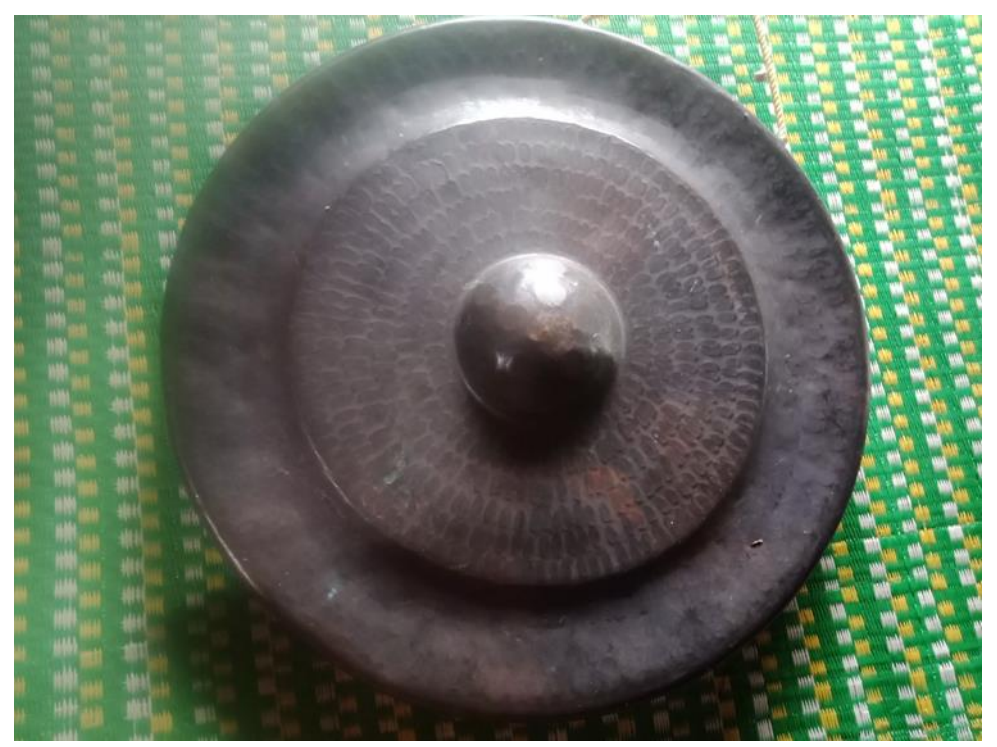
Fig. 8 The Ngoong mut instrument of the Pa Ko.

According to instrument-making artisans, gongs may be used in combination with other instruments or even played solo for entertainment purposes. In major ceremonies, gongs are often used to lead other musical instruments. Its primary function is to announce the stages of the festival while also serving as a solo instrument, harmonizing and accompanying folk songs. Surveys conducted on gongs in this region have shown that this instrument is a prime example of traditional musical culture and reflects the musical identity of the Pa Ko here, from the way it is performed to its functions.