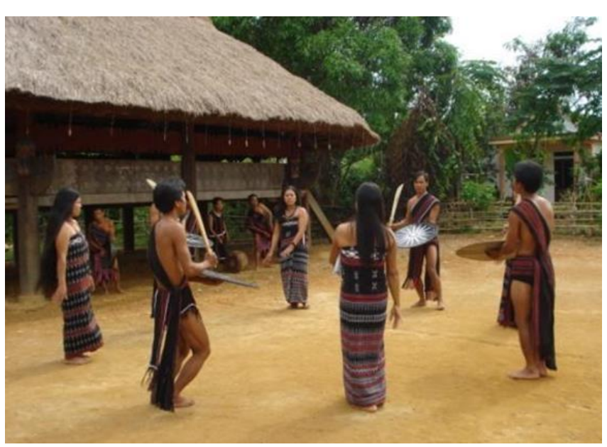
Fig. 3 Men and women's costumes of the Ta Oi people, next to their traditional house.

In addition to the A Rieu Piing festival, the Pa Ko people have other traditional festivals, such as Aada (seasonal festival) and Pul Boh (farm-keeping ceremony), which are significant in their cultural and religious activities. These rituals have created the identity and differences in culture and beliefs between the Pa Ko community and the Ta Oi community, and other ethnic groups of the same language family. A specific example of the Ta Oi people's costumes can be seen in Figure 3.