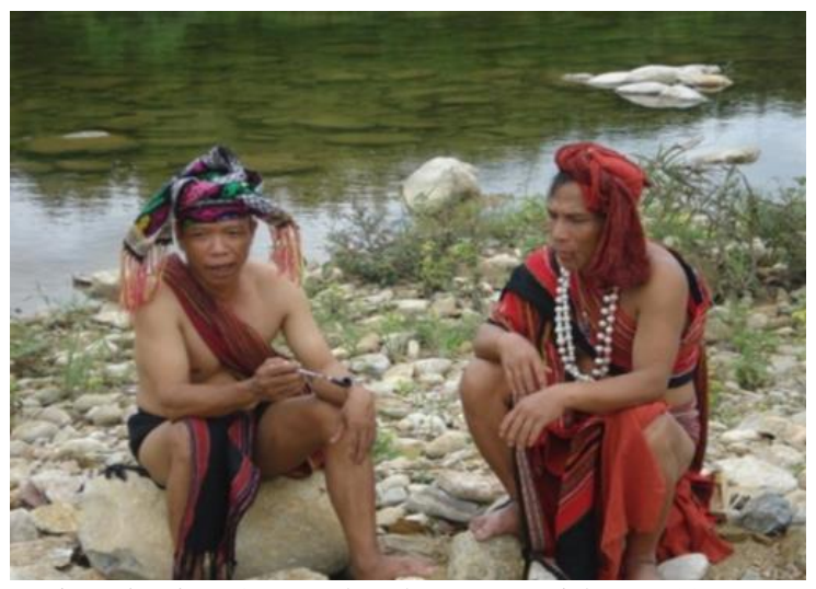
Fig. 5 Two Pa Ko artisans sing Cha chap.

Cha chap is primarily performed in two forms: solo and reciprocal. When young Pa Ko individuals reach the age of finding a romantic partner, they utilize Cha chap melodies to express and share life experiences and information with one another. It is common for couples to employ the song to convey their emotions and affection towards each other. Moreover, Cha chap is sung during weddings, New Year's Day celebrations, and various traditional festivals within the village (Figure 5). As a result, the song's contents may include themes of flirting, love confessions, as well as prayers for a peaceful and prosperous life before the gods ( Jang ). Gong and drum accompaniments are often used during performances of Cha chap .