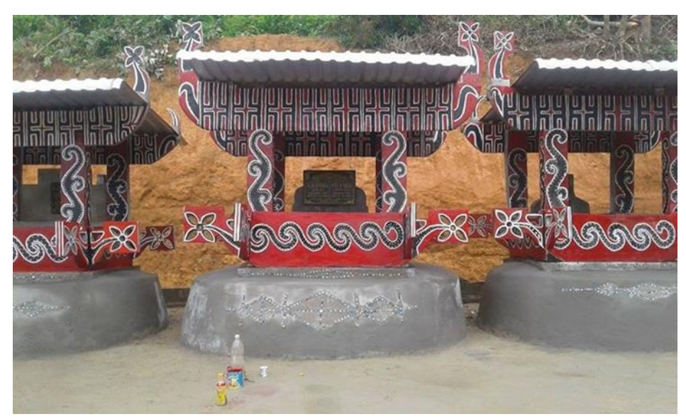
Fig. 2 Traditional tomb of the Pa Ko.

One of the significant cultural and material heritages of the Pa Ko people is their tombs (Figure 2). These spiritual architectures are associated with the A Rieu Piing festival, which is one of the most prominent rituals celebrated by the Pa Ko people in Vietnam.