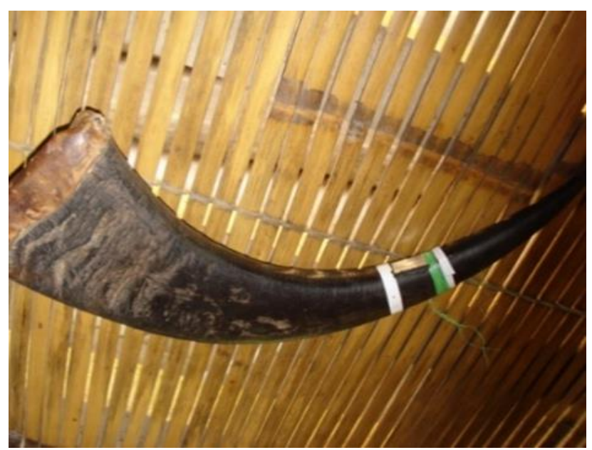
Fig. 10 The Pa Ko's CCorodooccadon.

While the Pa Ko people use a lot of wind instruments as mentioned above, the Ta Oi people are more inclined towards flutes. These aerophones include the flutes A hel , Te rel , Te reeng , and A reng . A brief description of these musical instruments is as follows: