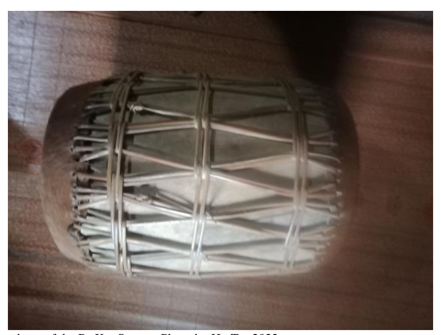
Fig. 12 The A kuur drum of the Pa Ko. Source: Photo by Ho Tu, 2022.

drums are made in Vietnam. However, the Pa Ko people also have drums carved from a wooden body. The drum that an artisan worked on is around 74 cm long and has a diameter of approximately 35 cm on both sides of the skin. People typically use buffalo skin or cowhide as the drum face. Besides A kuur , the Pa Ko people also have a large drum that is approximately 1 meter in height, with a drum surface diameter of about 50 cm. Drums play a significant role in the cultural activities of the Pa Ko people, from funerals to festivals, and dance and entertainment activities. The A kuur drum is played by men and is primarily used in harmony with other musical instruments, such as gongs, khen flutes, and Corodooccadon horns. Drums and gongs are two musical instruments that play the primary role in creating and keeping the rhythm in the traditional dance of the Pa Ko people.