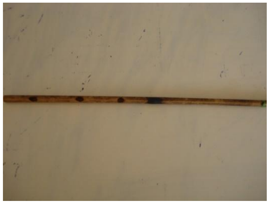
Fig. 11 The A hel, a vertical flute; Source: Photo: Nguyen Dinh Lam, 2019.

These flutes invariably accompany folk songs during cultural events and festivals of the Ta Oi people. Surveys and interviews with participants have confirmed that both young and elderly men play the flutes on festive occasions. They utilize the flute to express their emotions, share their joy, and convey their sorrows to those around them. The flutes are primarily used by men for entertainment purposes and as accompaniment to singing, rather than for funerals and worship. In addition to their use in concerts and solos, these remarkable flutes also fulfill the role of accompanying the folk songs of the Ta Oi people in this region.