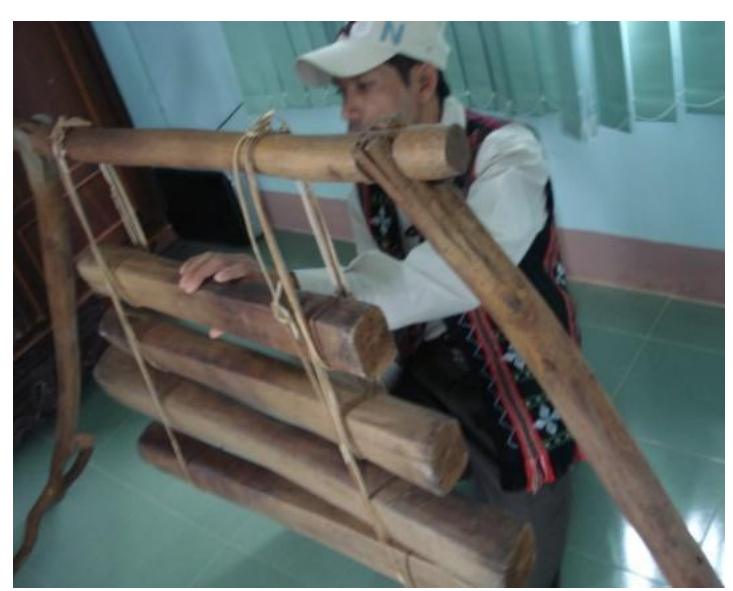
Fig. 9 The An toong.

The Ta Oi people popularize idiophone musical instruments that differ from those of the Pa Ko people. Notably, the Ta Oi people in A Luoi district still preserve a special set of resonant musical instruments known as An toong , which are percussion instruments made from wood (Figure 9). The An toong consists of four wooden lutes. Through research and interviews with instrument makers, I realized that the Ta Oi people have their own long-standing folk music identity. The musical aesthetic of the Ta Oi has reached a high level, as evidenced by their production of musical instruments using wooden sticks arranged according to the traditional scale of the people. The bars are hung on a wooden stand in order of sound, ranging from low to high. Consequently, the player can sit or stand depending on the height and position of the piano stand. This musical instrument is primarily used for entertainment activities, rather than being performed at funerals and folk religious ceremonies.