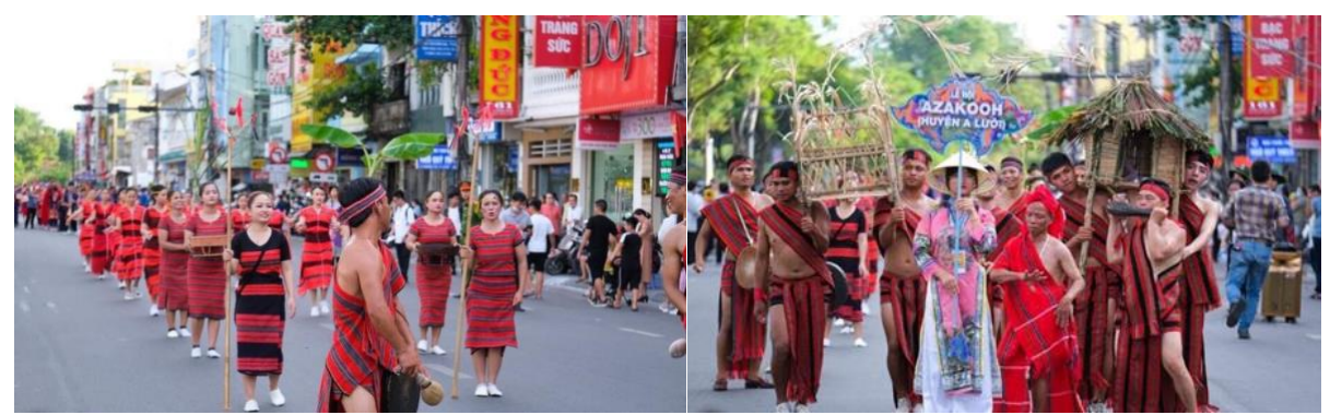
Fig. 1 Costumes and models of houses of the Pa Ko people in the Azakooh festival. The parade was held during a festival in Thua Thien-Hue city in 2022.

One of the significant cultural and material heritages of the Pa Ko people is their tombs (Figure 2). These spiritual architectures are associated with the A Rieu Piing festival, which is one of the most prominent rituals celebrated by the Pa Ko people in Vietnam.