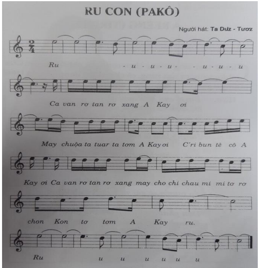
Fig. 4 A children's lullaby of the Pa Ko. Musical notation by Minh Phuong.

In-depth interviews conducted with Village Elder 1 and numerous artisans in the village revealed that the lullaby of the Pa Ko people is a unique lullaby, not borrowed from other ethnic groups. Researcher 1 added that lullabies are typically native songs, consisting of simple melodies and native languages, that are suitable for the lullaby space for babies. Artisan 15 explained that the lullaby of the Pa Ko people is a song that has been created, practiced, and passed down by Pa Ko fathers and grandfathers for generations. The lullaby of the Pa Ko people is distinct from the lullabies of other ethnic groups residing in proximity to the Pa Ko ethnic group. Field research conducted on Mon-Khmer ethnic groups in Thua Thien-Hue demonstrated that Ta Oi and Ka tu people in this region also possess their own unique lullabies.